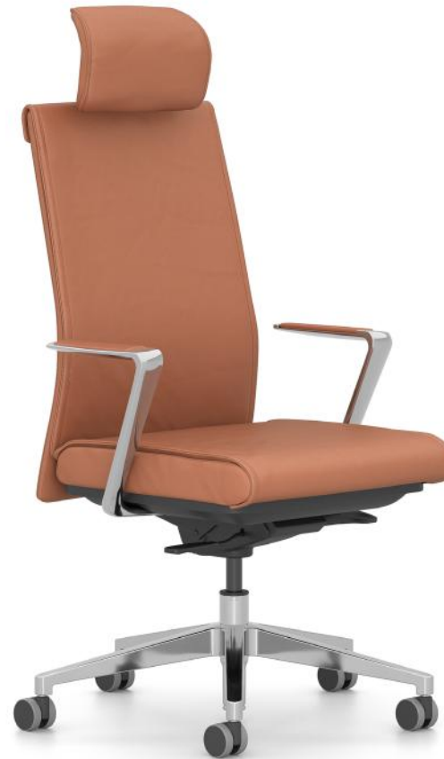
Pillow Top Styling