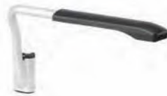
SR-40 For ST400 and ST400F chairs. Increases overall width of chairs to 24".

Cushion seat Cushion back Silver powder coated frame Stack up to 4 without dolly