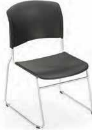
ST400 High Density Stacking Guest Chair

Graphite-color seat/back Silver-color tapered legs Wall-saving design Contoured molded seat Outboard arm design Carpet casters on all 4 legs (default) Stack up to 4 without dolly