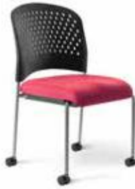
SG1K Stackable Guest Chair