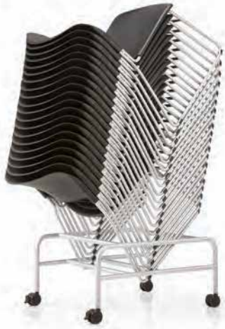
ST400 STACKS UP TO 30 HIGH ON STDLY4 DOLLY