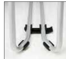
ST-GANG Option for all ST chairs. One pair gangs two chairs.