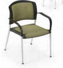
SG3B (arms) & SG3C (armless) Stackable Guest Chairs