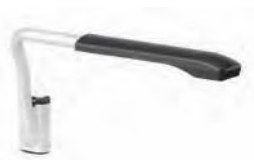
SR-40 For ST400 and ST400F chairs. Increases overall width of chairs to 24".

Cushion seat Cushion back Silver powder coated frame Stack up to 4 without dolly