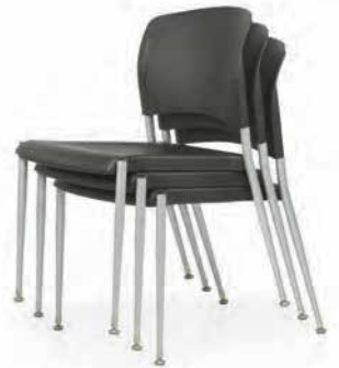
SG300 STACKS UP TO 5 HIGH ON FLOOR