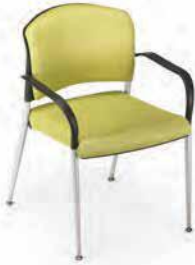
SG3W Stackable Guest Chair