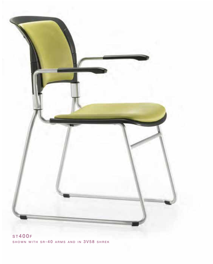
ST400F SHOWN WITH SR-40 ARMS AND IN 3V58 SHREK