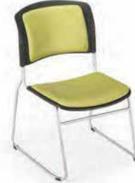
ST400F High Density Stacking Guest Chair

Black plastic seat Black plastic back Silver powder coated frame Stack up to 5 without dolly