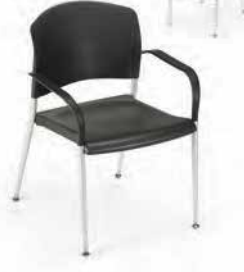
SG3A (arms) & SG300 (armless) Stackable Guest Chairs