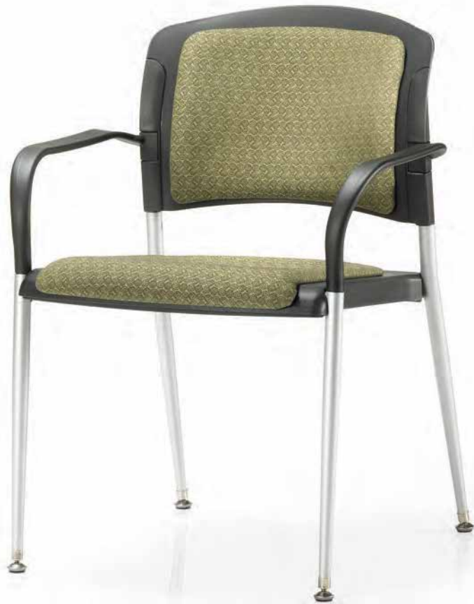
SG3B SHOWN IN 3318 CACTUS