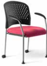
SG2K Stackable Guest Chair