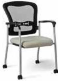
SG5K Stackable Guest Chair

Graphite-color back Graphite-color arms Silver-color tapered legs Wall-saving design Molded seat cushion Molded back cushion Self-leveling glides Stack up to 3 without dolly