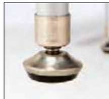
Self-Leveling Glide For all surfaces. Automatically adjusts.