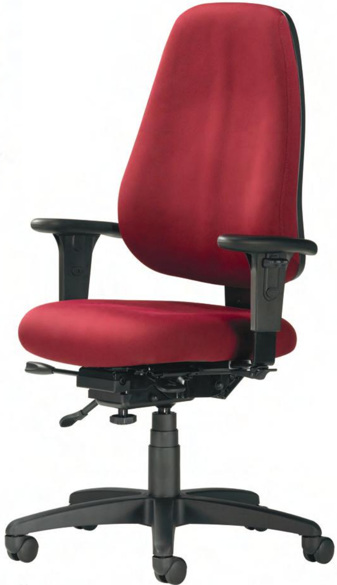
PC59 SHOWN WITH KR-240 ARMS