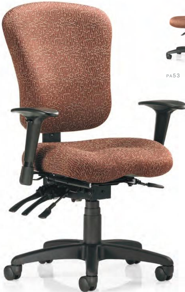
PA55 SHOWN WITH JR-37 ARMS