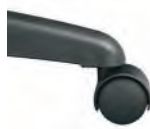
Regular Caster For carpeted surfaces, standard on most models.