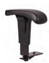
KR-300 Contoured arm pads Tallest height and width adjustable