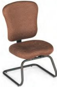
PA61S Guest Chair

Pneumatic lift Tilting backrest EZ back height adjustment Seat tilting Sliding seat