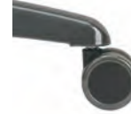
Dual Color Soft Caster For any surface, reduces surface marking.