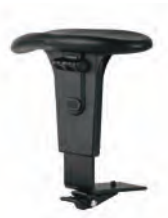
KR-240 Contoured arm pads Lowest height and width adjustable