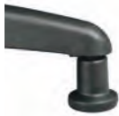
Glider For any surface, keeps chair or stool stationary.

Pneumatic lift Tilting backrest EZ back height adjustment Seat tilting Sliding seat Rocking tilt Infinite forward tilting Tension knob Fabric panel back