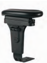
KR-251M Memosoft arm pads Ultra mobility arms with extension

Pneumatic lift Tilting backrest EZ back height adjustment Seat tilting Sliding seat Fabric panel back