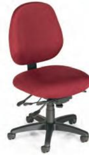
PC53 Task Chair