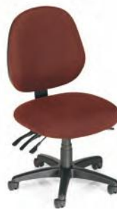
PA57 Task Chair

Pneumatic lift Tilting backrest EZ back height adjustment Seat tilting Sliding seat