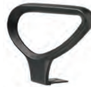
KR48 Loop arms Fixed position