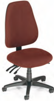
PA59 Executive Chair