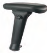
JR-50 Forward slanting Maximum mobility arm top