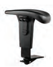
KR-200 Contoured arm pads Height and width adjustable