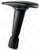
JR-37 Forward slanting Height and width adjustable