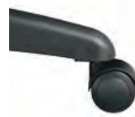
Reverse Braking For smooth surfaces, locks when user is seated.