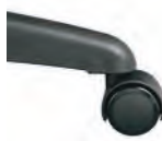
Self Braking Safety For smooth surfaces, restricts rolling when user is not seated.