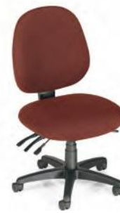
PA58 Management Chair

Pneumatic lift Tilting backrest EZ back height adjustment Seat tilting Sliding seat