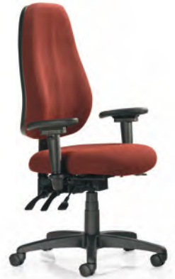
PA59 SHOWN WITH JR-40M ARMS