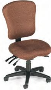
PA55 Management Chair

Pneumatic lift Tilting backrest EZ back height adjustment Seat tilting Sliding seat