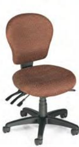
PA53 Task Chair