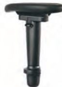
JR-40M Finger grip, Memosoft armpads Four way adjustable