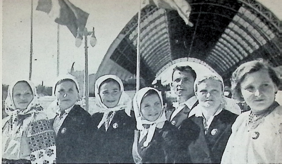
A group of collective farmers visiting the great Agricultural Exhibit in Moscow.

families in various types of producers' cooperatives numbered 195,000, which would have been regarded as an achievement by the cooperative movements of most countries; but this was less than one farming family in every hundred on the vast lands of the USSR. Outwardly they made little difference to the picture of the Russian countryside; most of the land was still farmed with primitive tools in long thin strips. The cooperatives themselves were small groups, from ten to thirty families working an average of 150 crop acres. Often their lands were still scattered in many pieces among the village fields. This was far from what Soviet leaders regarded as the urgent need of the country—a basic change-over to mechanized farming through cooperative forms.