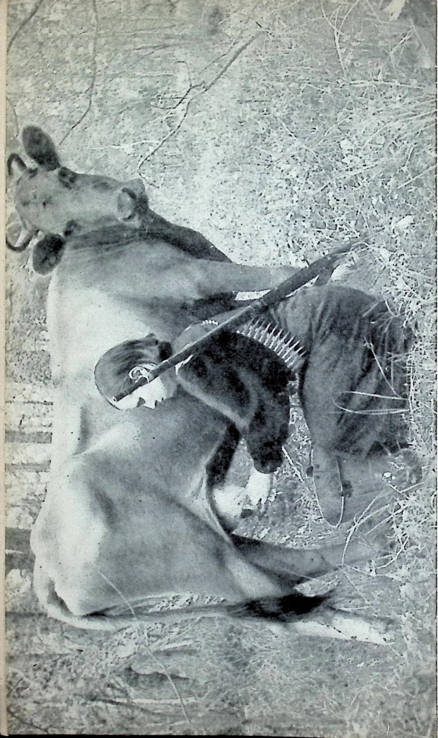
A collective farm woman with a guerrilla band deep in the woods behind the German lines, helps to provide nourishment for the wounded.