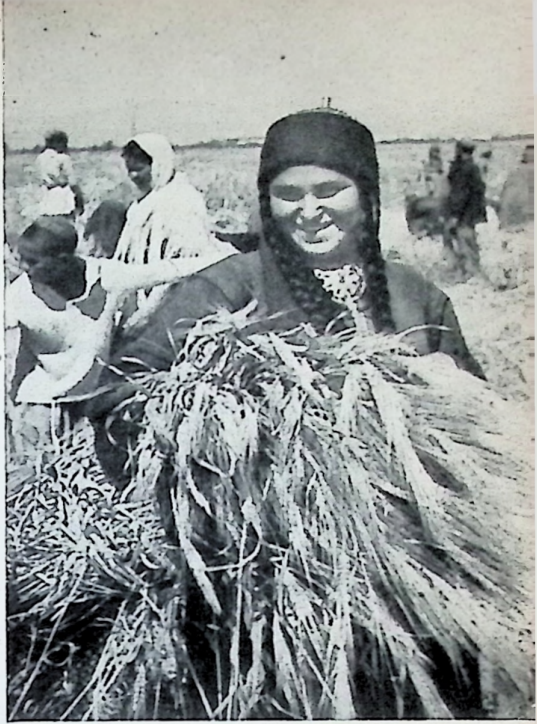
A Turkmenian schoolgirl helps bring in the barley harvest of a collective farm in her native republic.

is, been introduced into new areas, have so liked their new homes that they remain. Elsewhere they are being returned to their old homes. In 1943 the yields of all crops but grain were above those of 1942, while production of vegetables and potatoes was above that of any pre-war year. Due to the extent of the devastation and the shortage of manpower and draft power on the farms, there can be no thought as yet of reaching pre-war acreage or productivity. But this year will show great increases in all crops, as the good Soviet land is returned to those who own and love it.