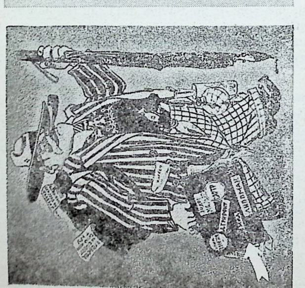
Here is reproduced the Krokodil cartoon as it appeared in Newsweck, Observe that the "Andre" has been blocked out, and only the "Zhid" is visible.

in the March 20 issue of Krokodil. The arrow clearly This reproduction is from the original as it appeared shows the name "Andre Zhid," which is the Russian transliteration for Andre Gide, French writer.