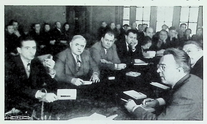
Conference: CIO delegates and Soviet union leaders sit around the table to discuss labor problems in the United States and the USSR. The scene above, duplicated many times during the American unionists' eight-day tour, was in the director's office of a large Leningrad factory.

cuss a particular grievance only in the presence of the worker who advances it and the decision must be made openly in his presence. The decision can be appealed through a whole series of higher committees of union and management, but if it is still unsettled after this procedure has been followed the final decision will rest with the AUCCTU. Once a decision has been duly rendered a plant director who fails to comply with it can be taken to court and made to pay damages if found guilty.