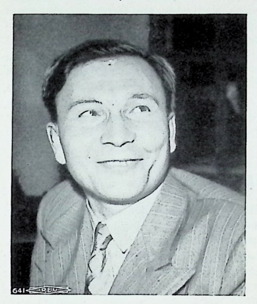
Vasili Kuznetsov, chairman of the Soviet trade union congress and host to the CIO delegation.

A FTER a brief stopover in Berlin, the CIO delegation arrived in Moscow on October 11 and remained in the Soviet Union until October 19, when it left for London enroute to the United States. The short duration of this eight-day visit was deeply regretted by the delegation, but it was necessitated by the fact that the delegation had to be back in the