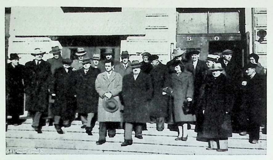
On the move: CIO delegates covered a lot of ground during their visit to Soviet plants. Here they're leaving a large Leningrad machine factory.

plants, shop meetings and workers' clubs. The eager desire of the Soviet people for closer ties of understanding and friendship with the people of the United States has been evidenced again and again.