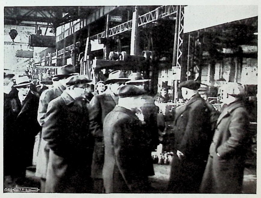
Escorted by Russian trade unionists, the CIO delegation gets first-hand information on Soviet industrial processes and labor organization.

All civilians who could not fight or work were finally evacuated from the city, after Lake Ladoga, the city's only lifeline, had finally frozen