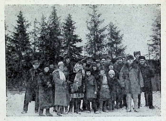
German Workers-Shock-Brigaders of the Iron and Steel Smelting Works at Nadezhdinsk in the Urals

by two more made of iron, according to plans submitted by us. Many other alterations suggested by us, e. g., a new distribution of models, were also put into effect, and our suggestions were carried out in regard to the preparation of sand and lighting. But there are some badly needed technical improvements which for the present cannot be carried out at our own plant.