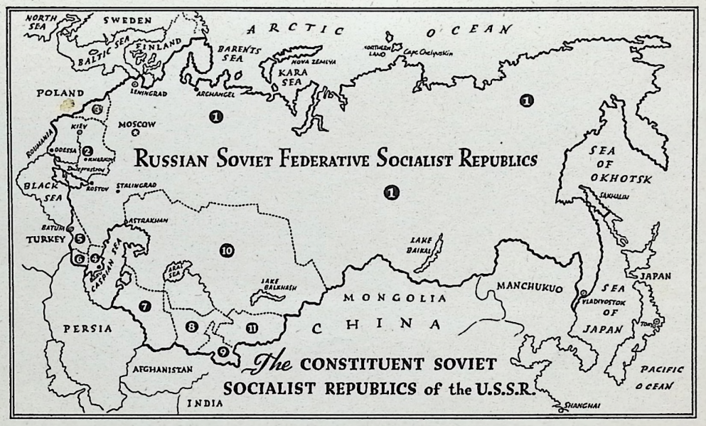
KEY: 1. Russian Soviet Federative Socialist Republics. 2. Ukrainian Soviet Socialist Republic. 3. Byelorussian S.S.R. 4. Azerbaidjan S.S.R. 5. Georgian S.S.R. 6. Armenian S.S.R. 7. Turkmen S.S.R. 8. Uzbec S.S.R. 9. Tadjik S.S.R. 10. Kazakh S.S.R. 11. Kirghiz S.S.R.