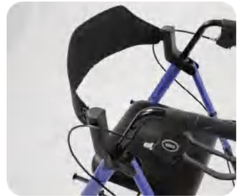
03 Fasten the caps

Handles and backrest installation complete as the following picture.