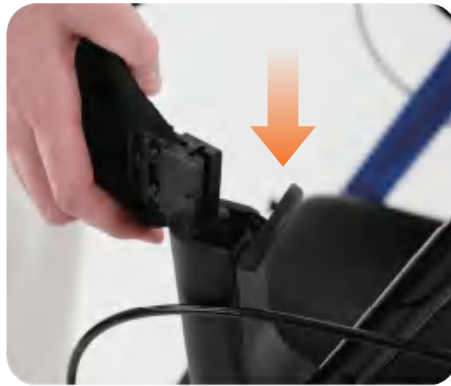
02 Insert backrest on both sides