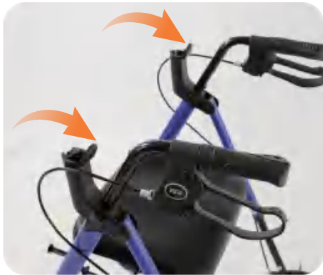
01 Open backrest fixer caps