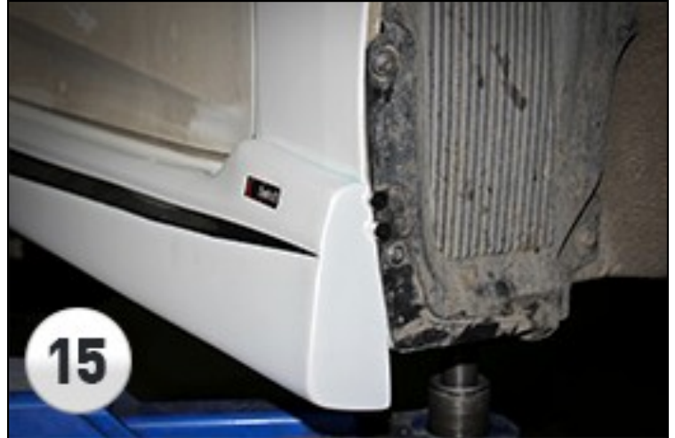
14. Bolt the front side of the side skirt with the supplied hardware (Figure 15)