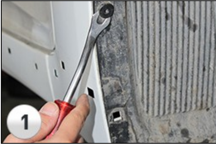
1. Remove OEM clip in rear wheel well (Figure 1)