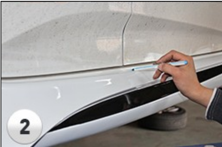
2. Align side skirt to body line and mark with a washable marker or preferably painters tape (Figure 2)