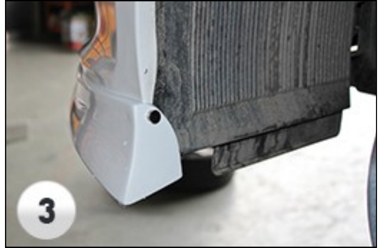
3. Make sure the side skirt is line up with the front lip (Figure 3)