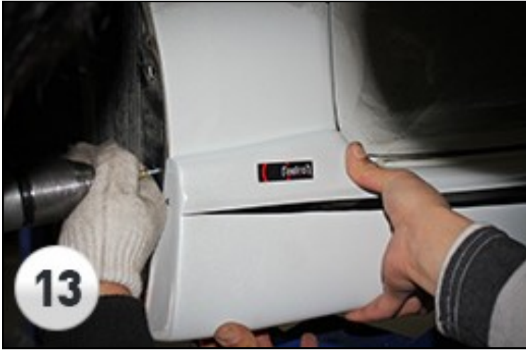
12. Drill the second hole in the wheel well (Figure 13)