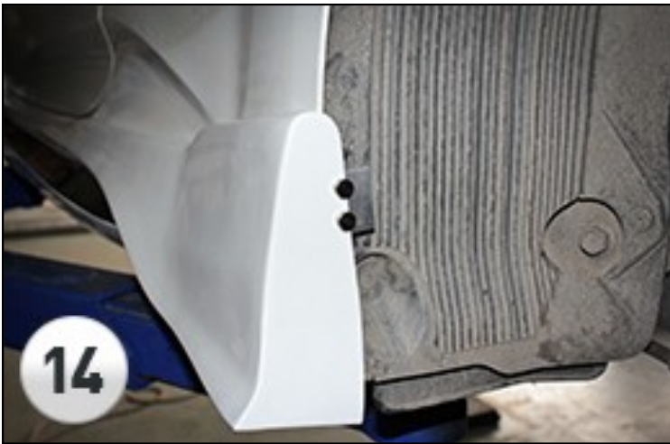
13. After putting the mounting brackets on, bolt the rear side of the side skirt to the wheel well (Figure 14)