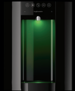
Black - Countertop