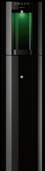
Black - Floorstanding