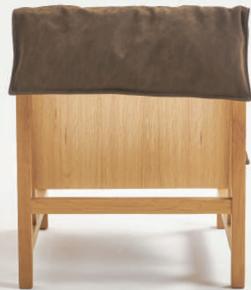
light oak - seduce moss