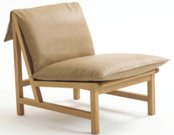
light oak - montana desert