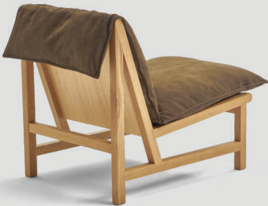
light oak - seduce moss