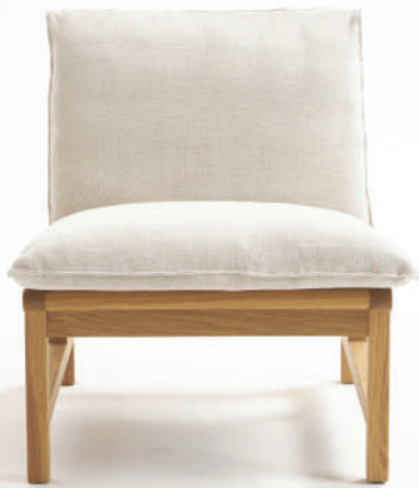
light oak - asa ivory