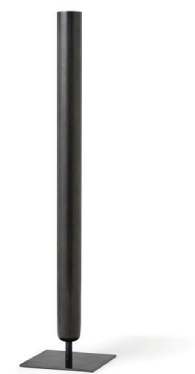
Bronzed Brass 4785859