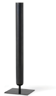
Bronzed Brass 4784859