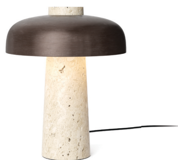
Reverse Table Lamp, Bronzed Brass 1410619