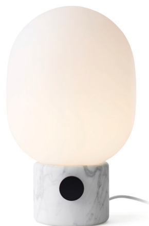
Carrara Marble 1830639