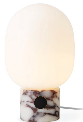
Calacatta Viola Marble 1830319