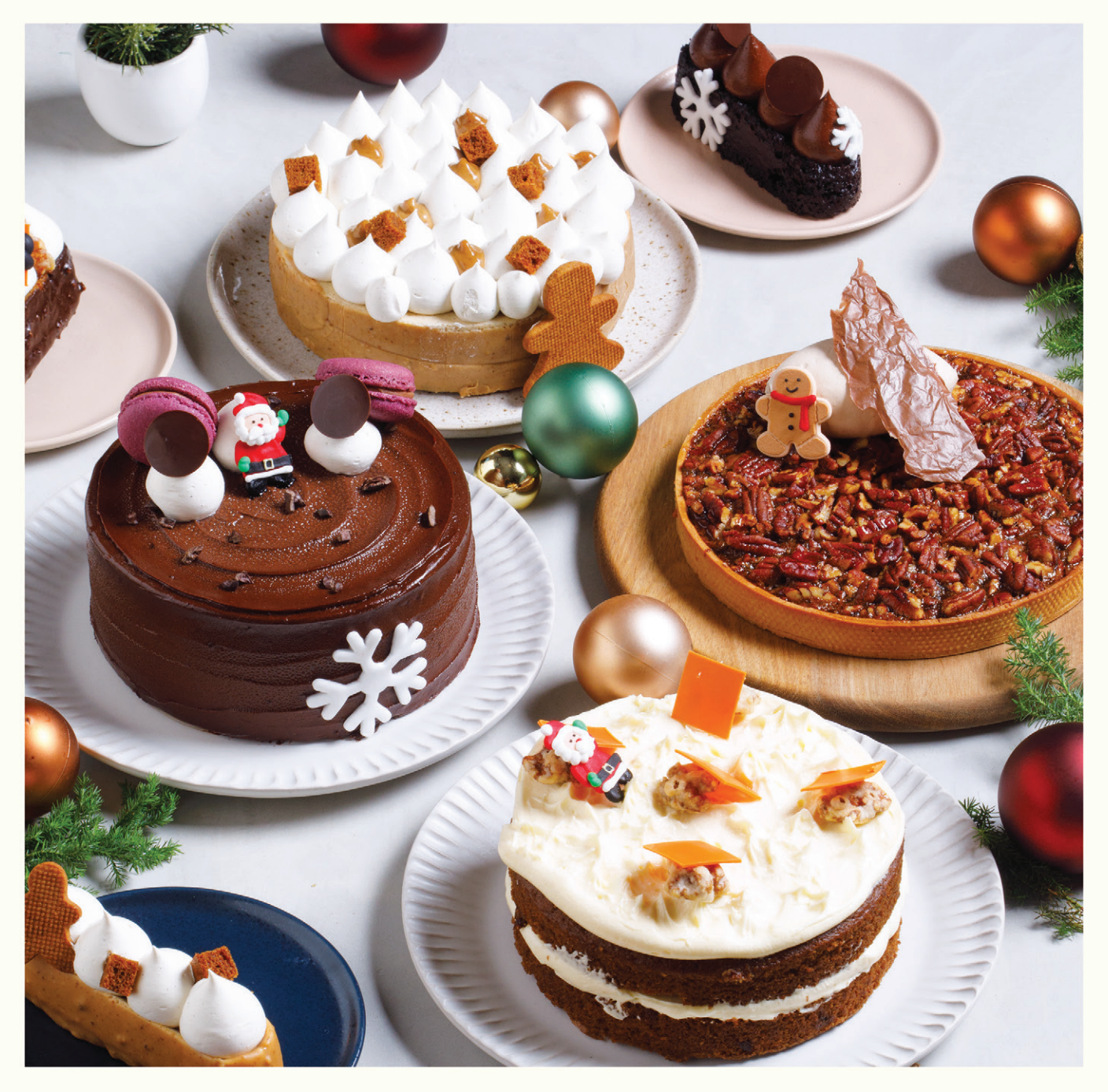
Depending on availability, products and prices may change without prior notice. For Festive Feasts, please order 5 days in advance.

A two-layer carrot cake that is moist and flavorful, generously frosted with cream cheese goodness.