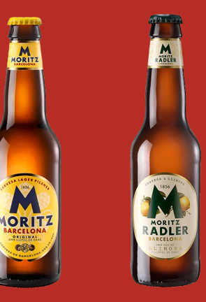
MORITZ MORITZ Original Radler Lager 330ml 330ml P160/btl P170/btl P865/6-pack P920/6-pack