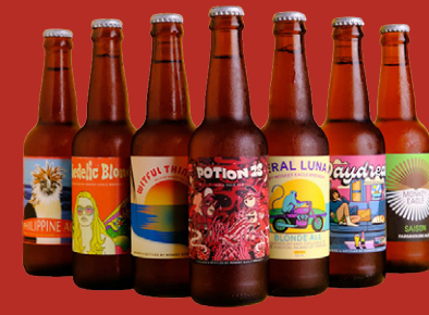
MONKEY EAGLE BEER Philippine Ale 330ml Psychedelic Blonde 330ml Witful Thinking 330ml Potion 28 330ml General Luna 330ml Daydream Session Pale Ale 330ml Saison 330ml

Per Bottle P165 Pre-Assorted 5 + 1 Pack P825