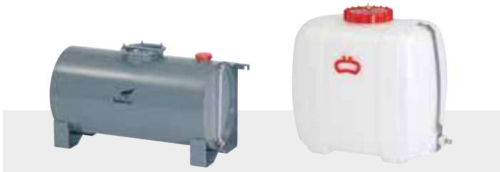
Spraying tank, stainless steel, capacity 69 l, standard with Fontan Mobilstar M, optional accessory Fontan Mobilstar E and ER