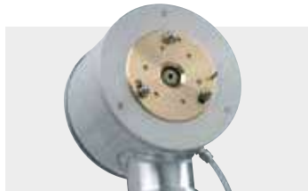
Spraying head ULV/LV