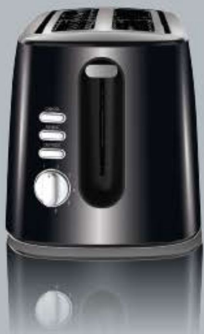
Toaster Model TS3206SS