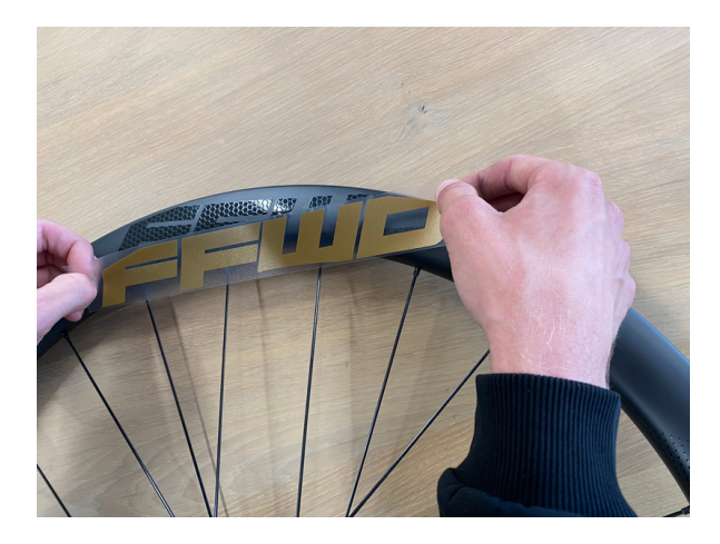
Step 2: Start lining out the FFWD D on your decal with the D on the rim.