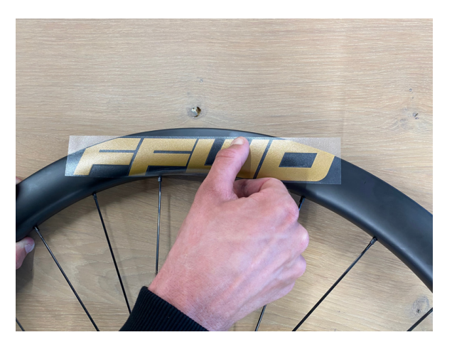
Step 4: Press the decal gently but firmly on the rim.