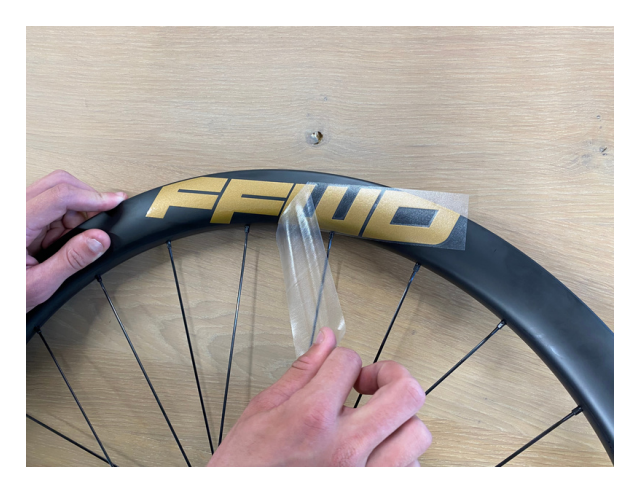
Step 5: Remove the remaining foil.