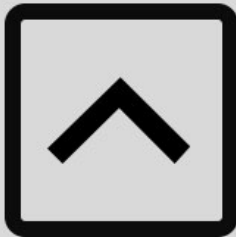
Volume UP Adjust clock/date