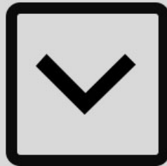
Volume DOWN Adjust clock/date