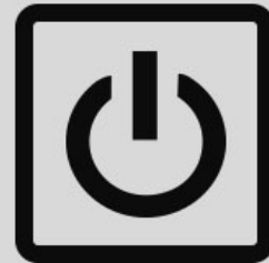
Power On / Off