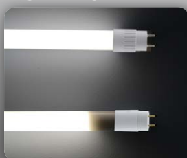
Other LED Tubes