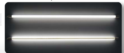
Lamp Back View