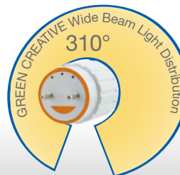
Lamp Front View

This lamp uses an innovative glass design that diffuses heat and light more evenly. As a result of its compact light engine, this lamp produces a light emitting area of 310°. This wider beam angle improves a fixture's total light distribution and creates a more complete lighting effect.