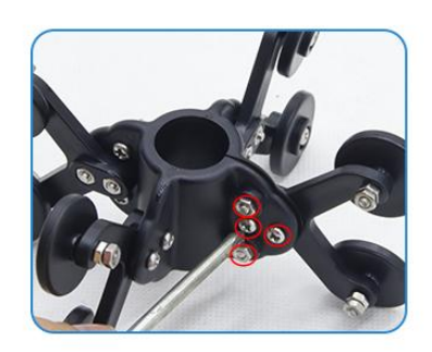
1. loosen the 4 screws and expand the space of the pulley