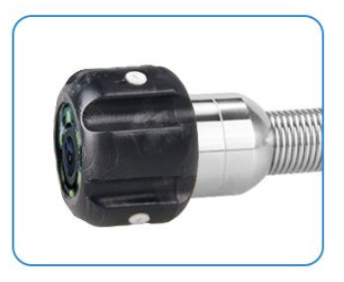
3.use the mini screwdriver to tighten the white screws