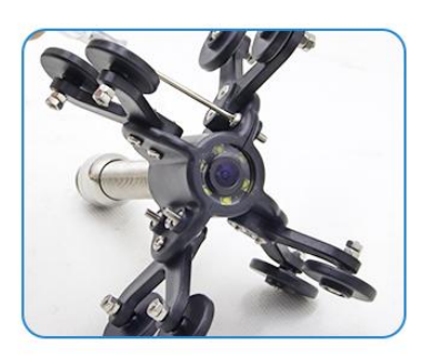
3. put the screws back and tighten