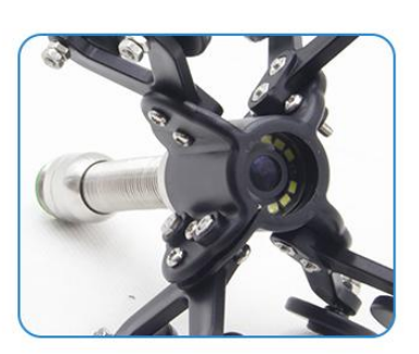
2. put the pulley on the camera probe