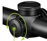
Illumination Control Knob

To install/change the battery, unscrew the Illumination Control Knob's cap using provided turret tool and install a new CR2032 battery with the positive side (+) facing out.