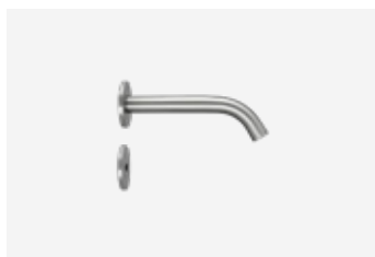
150mm IR Sensor Tap TSL.884