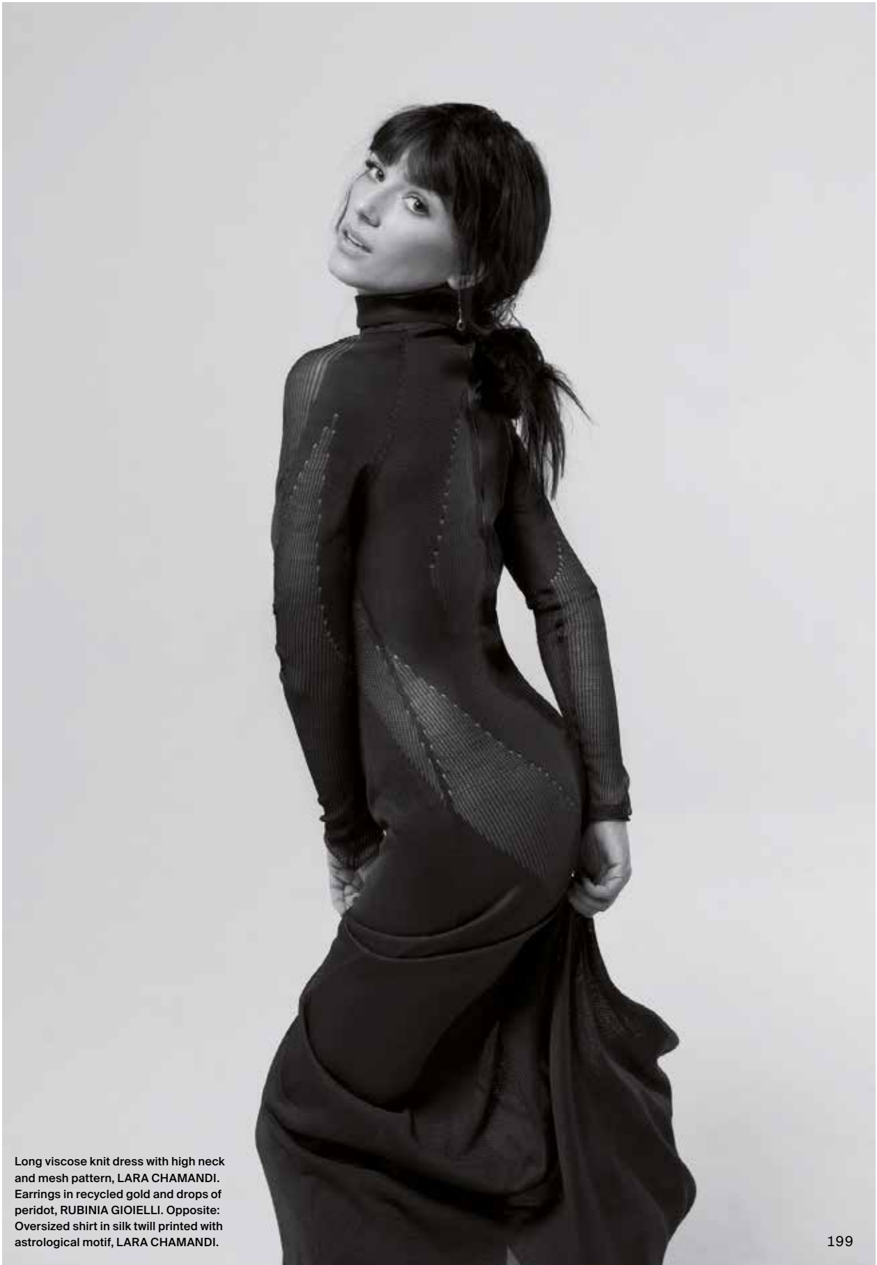
Long viscose knit dress with high neck and mesh pattern, LARA CHAMANDI. Earrings in recycled gold and drops of peridot, RUBINIA GIOIELLI. Opposite: Oversized shirt in silk twill printed with astrological motif, LARA CHAMANDI.