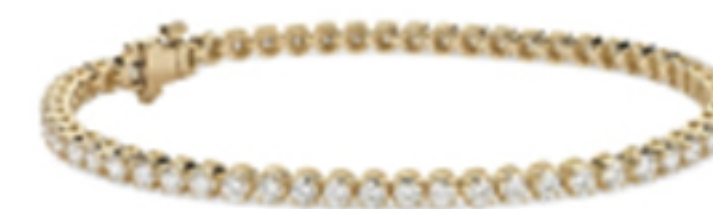
Bella Moi 3.15ct 14k Yellow Gold Moissanite Bracelet