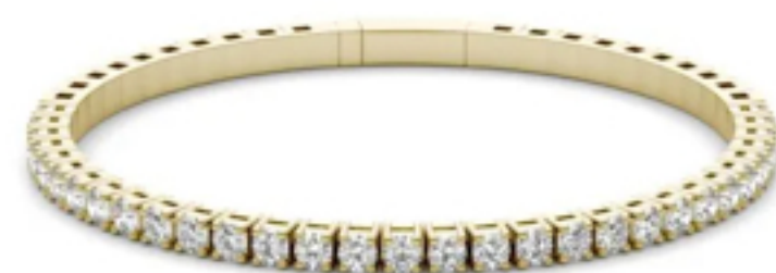
3.10ct dew 14k Yellow Gold Moissanite Bracelet

OUR EXPANSIVE AND UNMATCHED PRODUCT RANGE