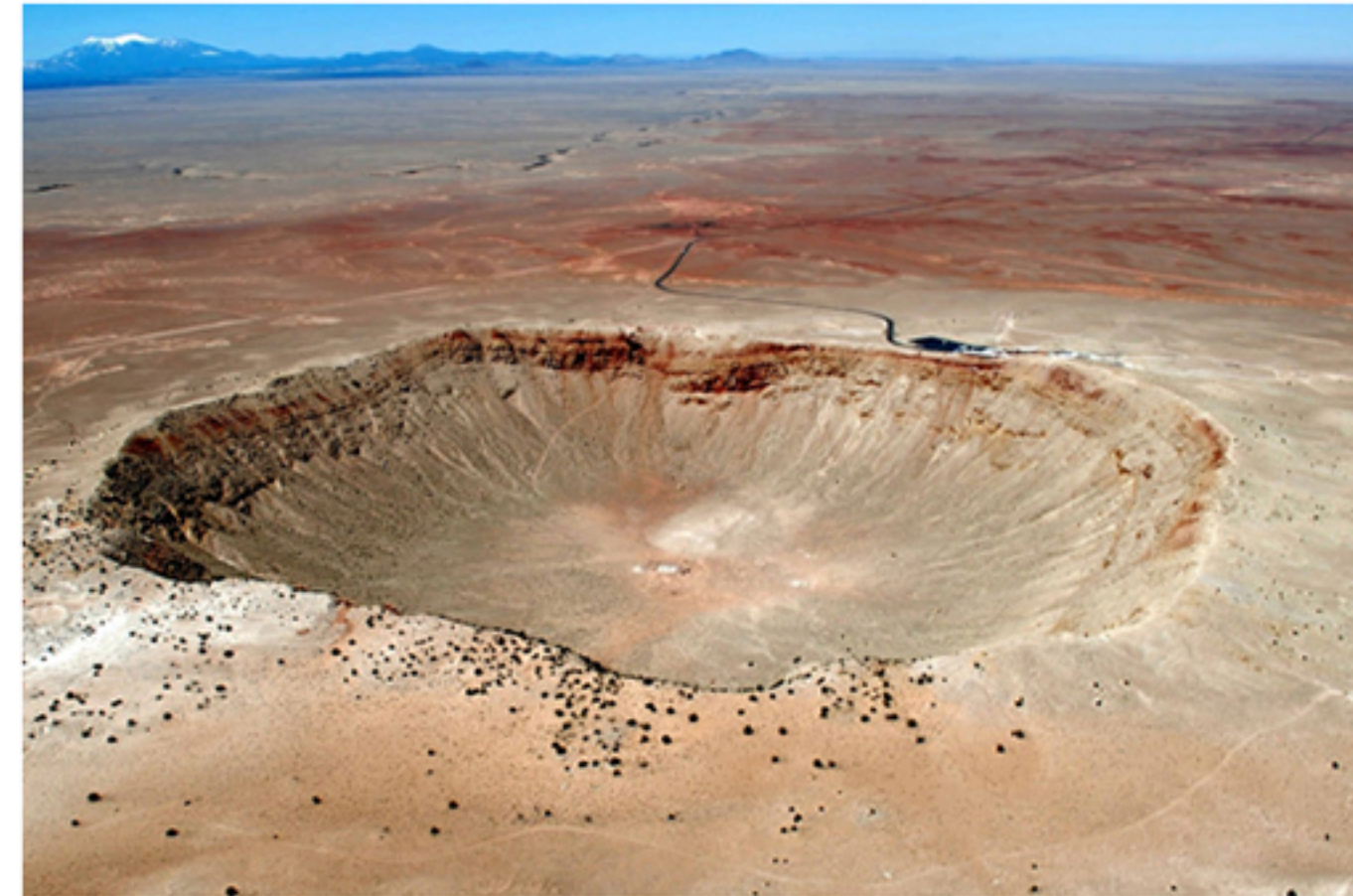
The Canyon Diablo Meteorite Impact Crater, Arizona, USA.

Natural moissanite was discovered in 1893 by Dr. Henri Moissan, a distinguished French chemist who eventually won the Nobel Prize. Dr. Moissan began researching geological bits of a meteorite recovered from a meteor crater in Arizona (Canyon Diablo). He observed tiny amounts of a shimmering substance in these shards. In 1905, George Kunz, a well-known Tiffany & Co. gem expert and mineralogist, proposed that the diamond be named moissanite in honor of Dr. Moissan.