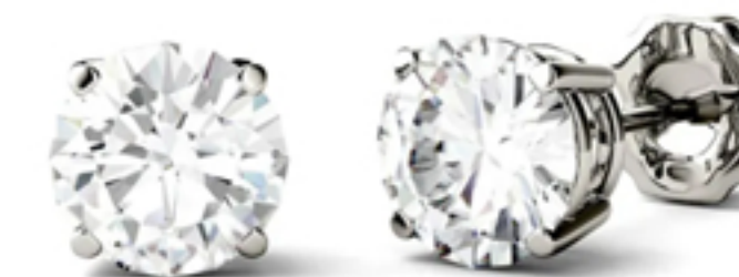
Helzberg 2.00cts dew in 14k White Gold