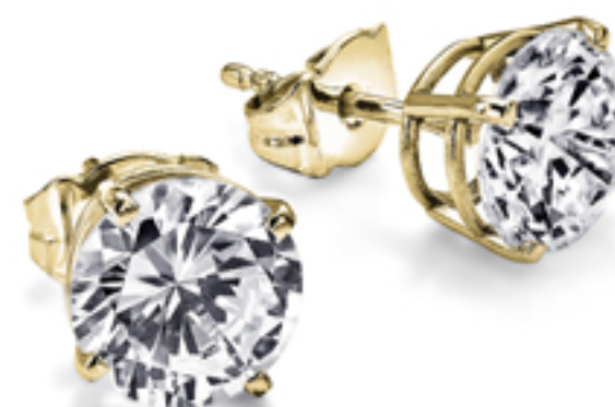
Bella Moi 2.00cts dew cts in 14k yellow gold

Suggested retail $450.00 Your cost as a partner $99.00