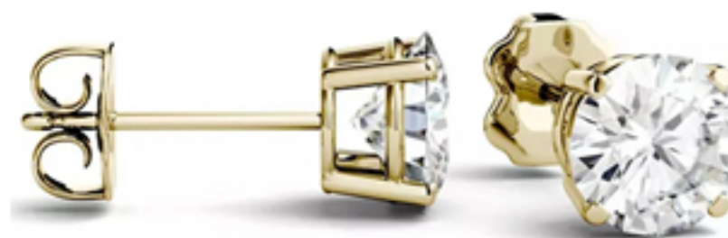
Macys' Charles and Colvard 2ct dew cts in 14k yellow gold

OUR EXPANSIVE AND UNMATCHED PRODUCT RANGE