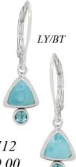
82712 $29.00 double bezel w/ leverback ear wire

"Larimar is a rare stone found only in the Dominican Republic"