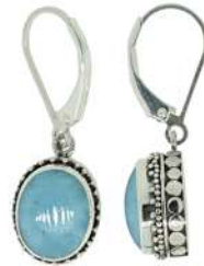
82362 $34.00 leverback