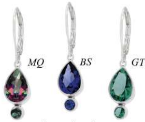
leverback 82737 $23.00