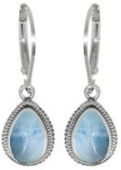
82361 $29.00 leverback

"Larimar is a rare stone found only in the Dominican Republic"