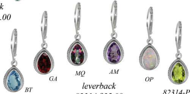
leverback 82314 $25.00