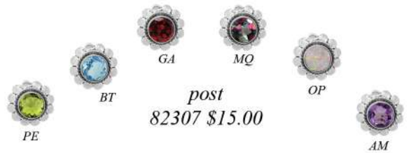
post 82307 $15.00