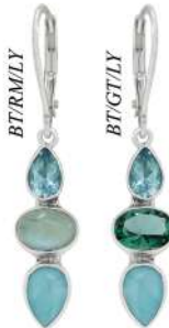
82736 $42.00 leverback ear wire