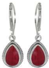
82242 $18.00 leverback