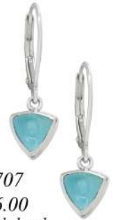
82707 $26.00 double bezel w/ leverback ear wire