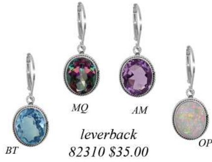
leverback 82310 $35.00