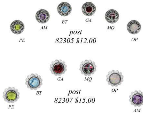
post 82305 $12.00