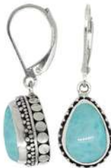
82363 $24.00 leverback