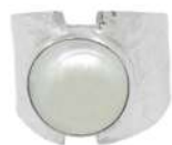
81809-PL SZ 7-10 $28.00