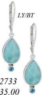
82733 $35.00 leverback ear wire