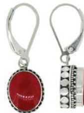
82237 $22.00 leverback