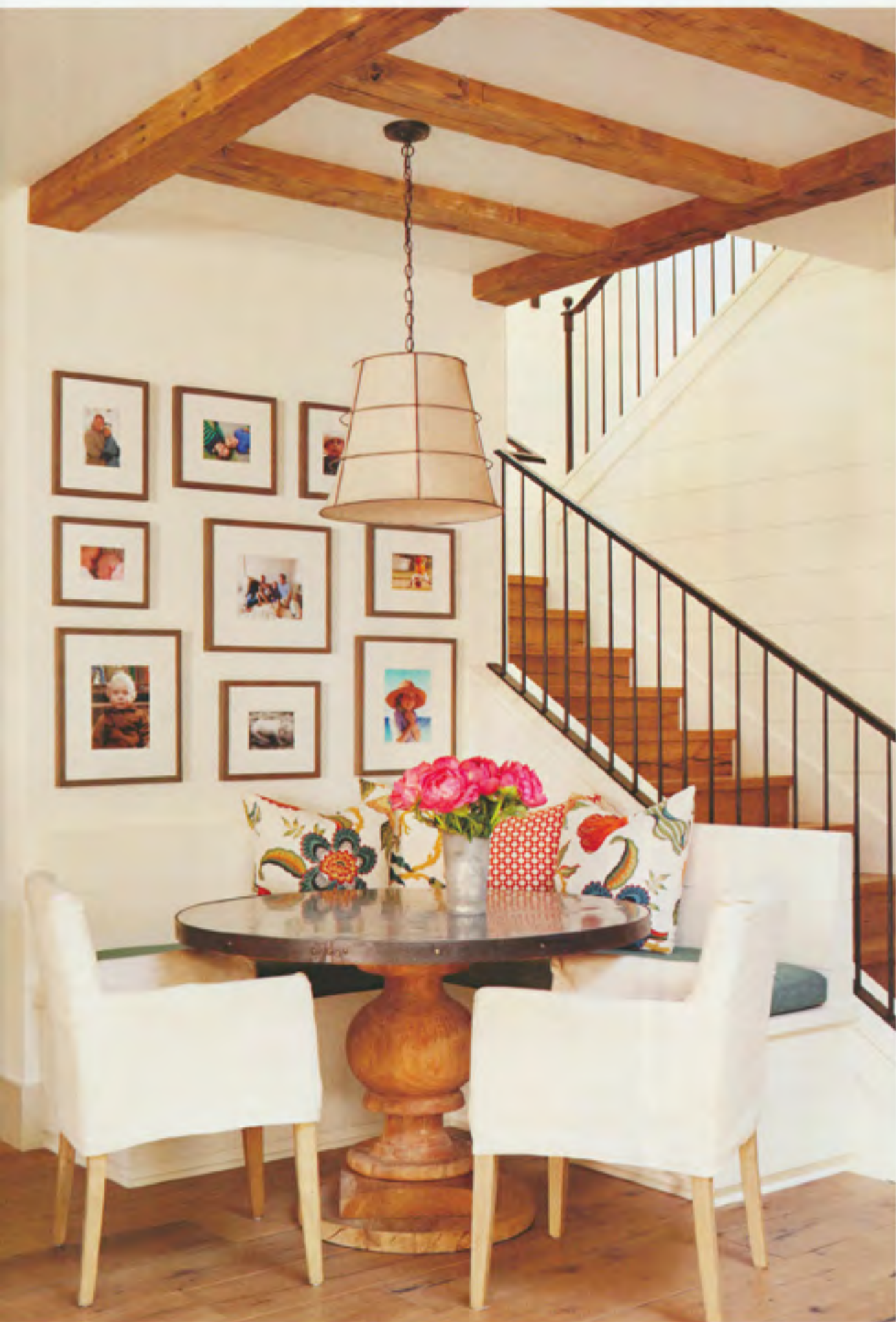
In the open kitchen, a zinc-topped breakfast table from R.J. Imports is paired with Dovetail Furniture chairs, which the designers slipcovered with vintage linen. Pillows made with Schumacher fabrics lend a punch of color.