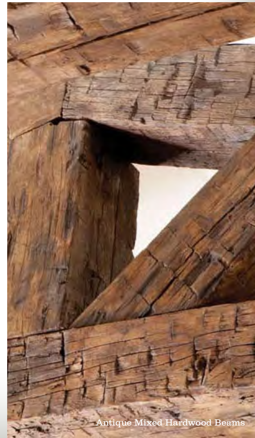
Antique Mixed Hardwood Beams