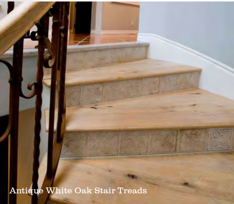
Antique White Oak Stair Treads