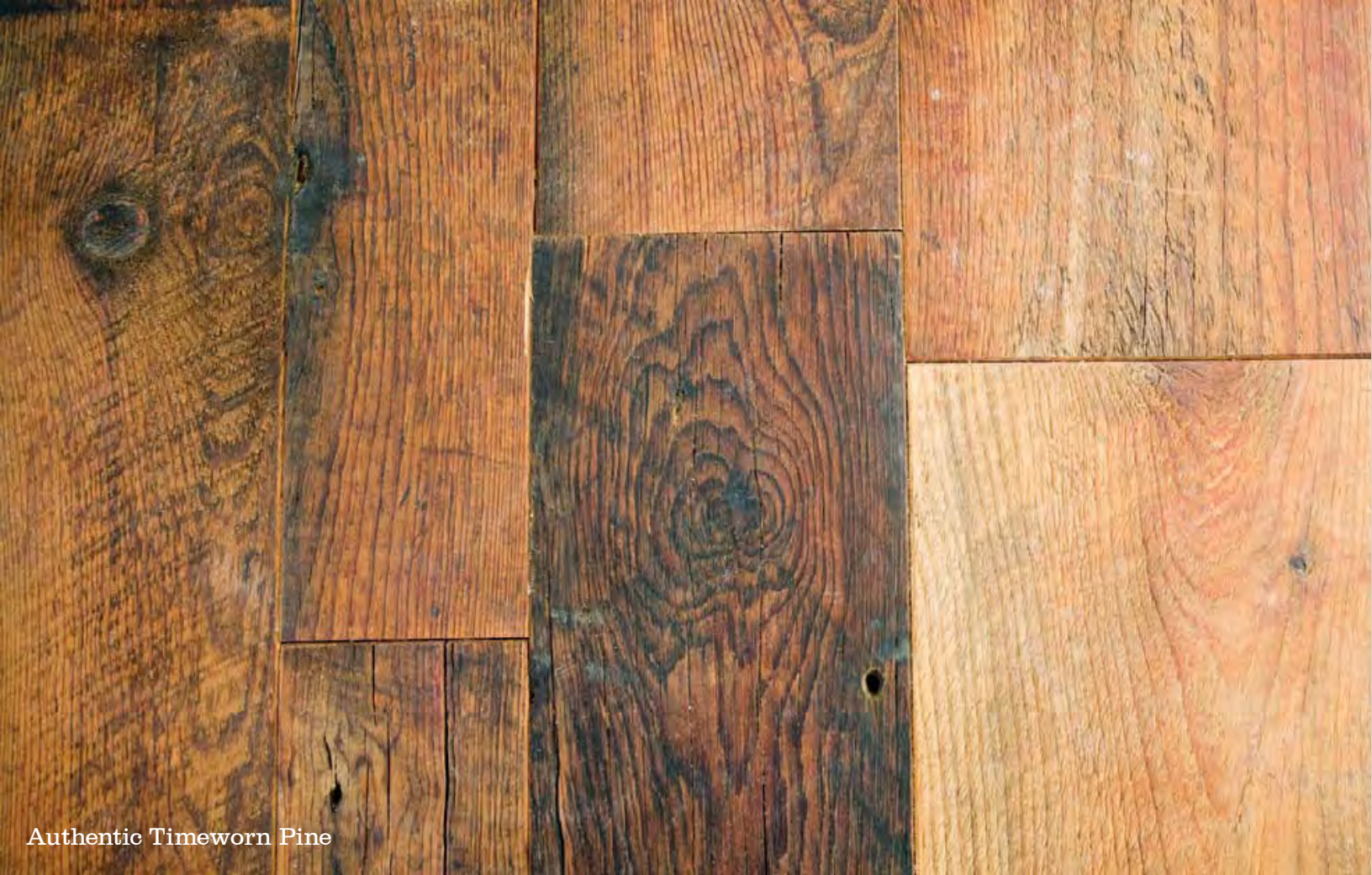
Authentic Timeworn Pine