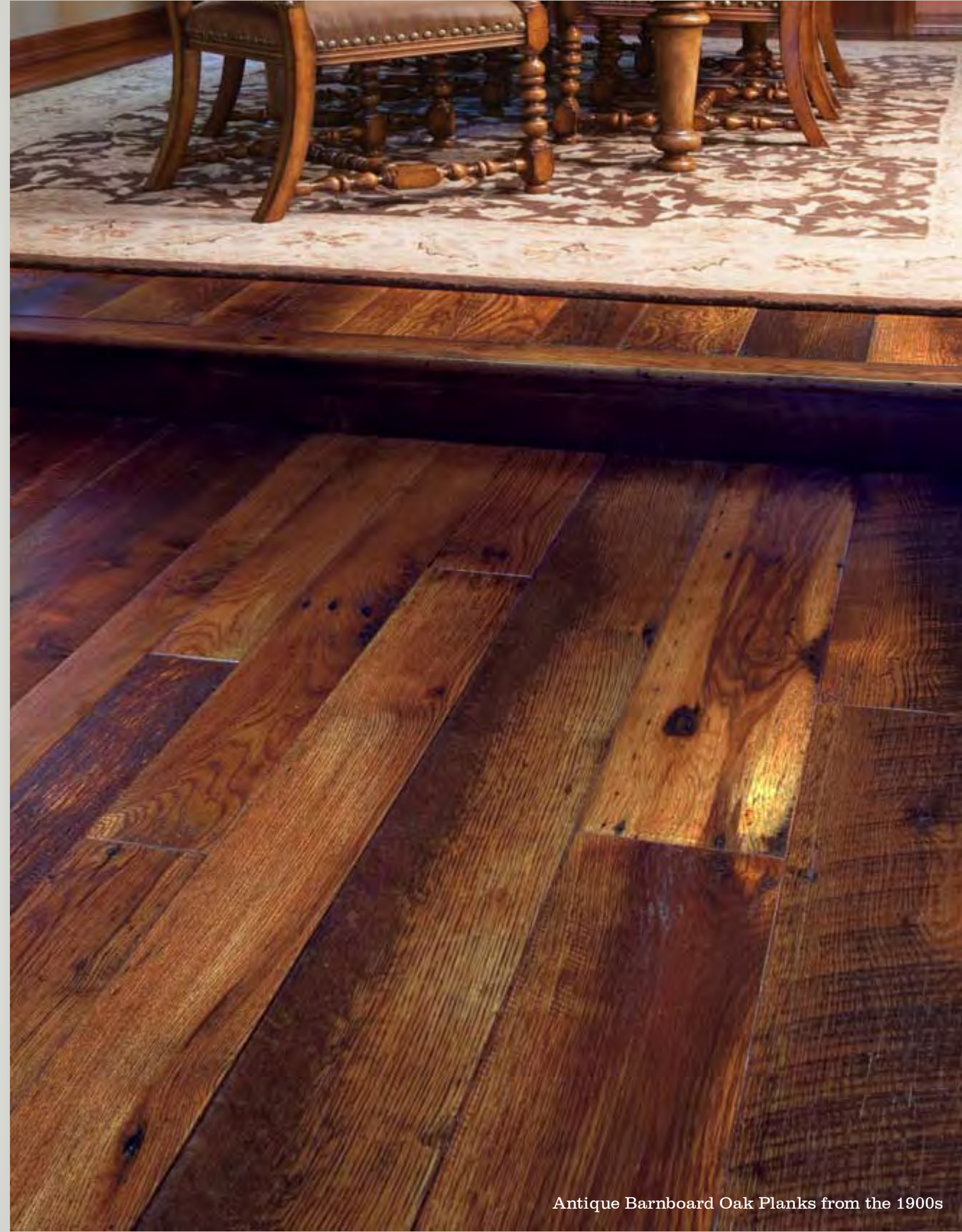
Antique Barnboard Oak Planks from the 1900s

Southern Californians will also be delighted to learn that The Vintage Wood Floor Company is local. All of our floors are crafted in Orange County and our local warehouse and "yard" has hundreds of thousands of board feet of antique reclaimed wood inventory. Our showroom, only a few miles from the coastal cities of Newport Beach, Laguna Beach, and Corona Del Mar, as well as a short drive from San Diego and Los Angeles counties, offers unusually large sized samples and the opportunity to see and feel our products in person. Differing from new wood, antique reclaimed wood can vary from board to board, which is why it's important to see a larger sample. This can make all the difference when it comes to selecting a material that will be a cornerstone in your home.