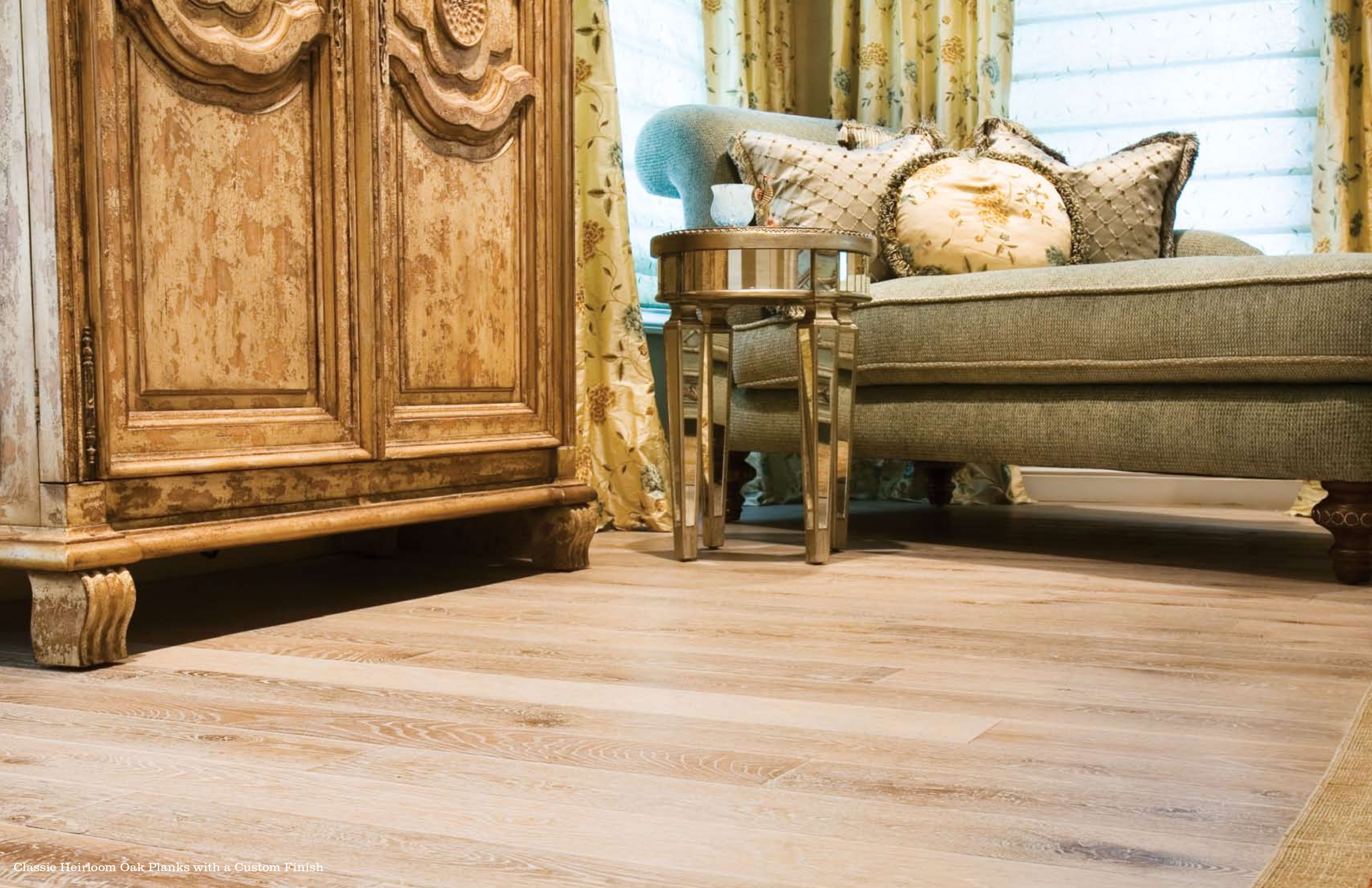
Classic Heirloom Oak Planks with a Custom Finish