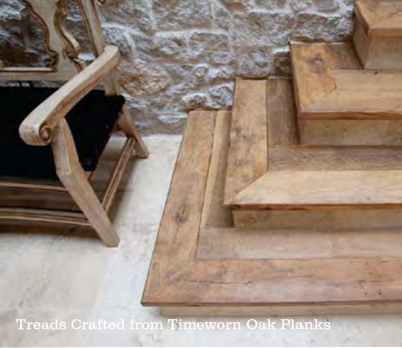
Treads Crafted from Timeworn Oak Planks