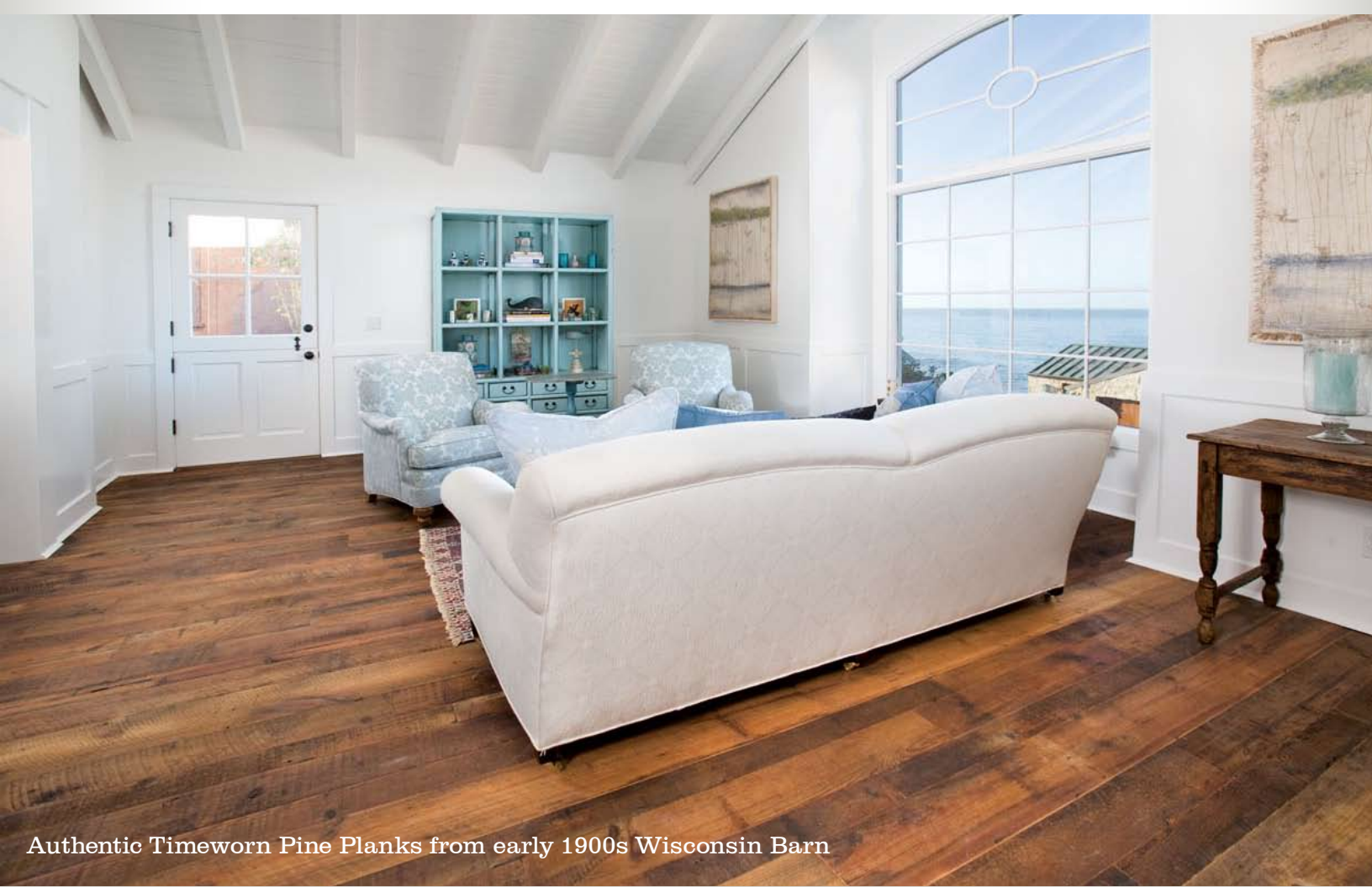
Authentic Timeworn Pine Planks from early 1900s Wisconsin Barn