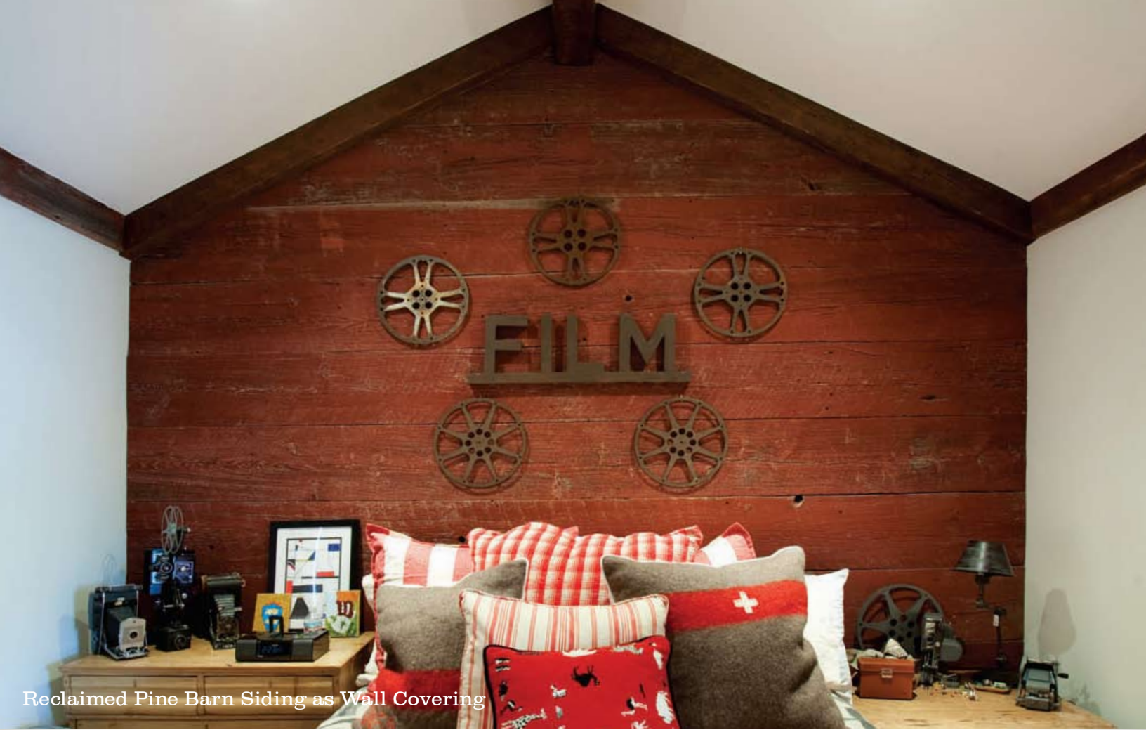
Reclaimed Pine Barn Siding as Wall Covering