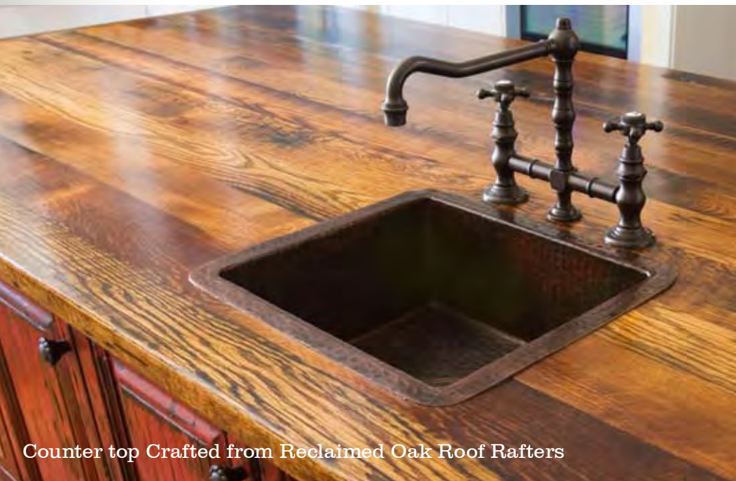
Counter top Crafted from Reclaimed Oak Roof Rafters