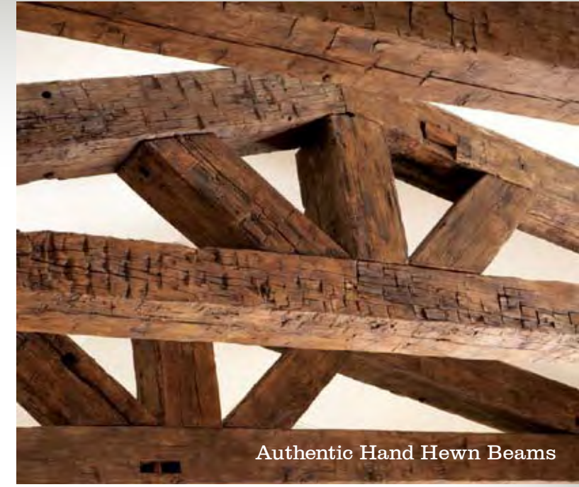
Authentic Hand Hewn Beams