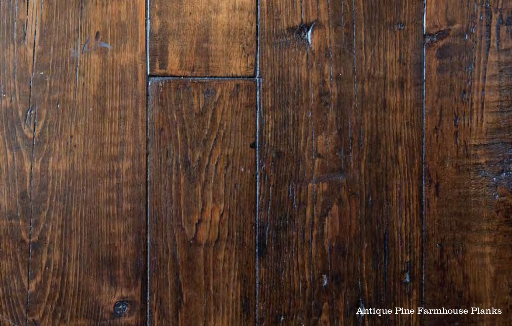
Antique Pine Farmhouse Planks