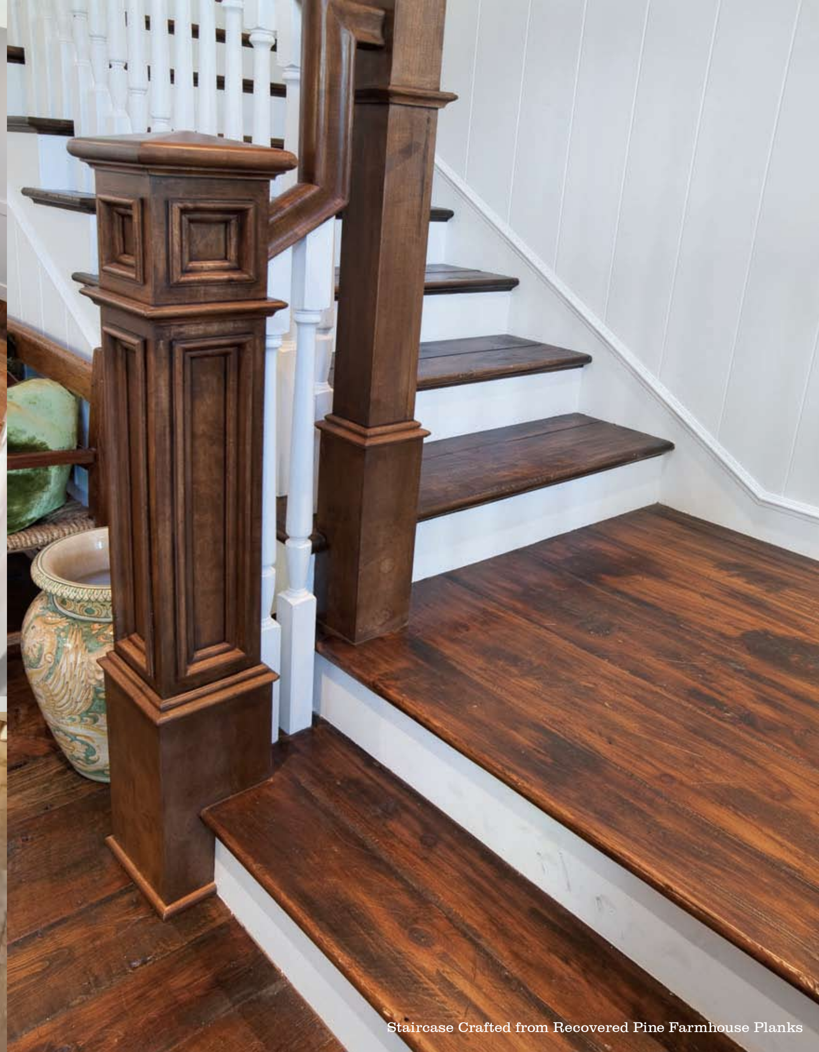
Staircase Crafted from Recovered Pine Farmhouse Planks