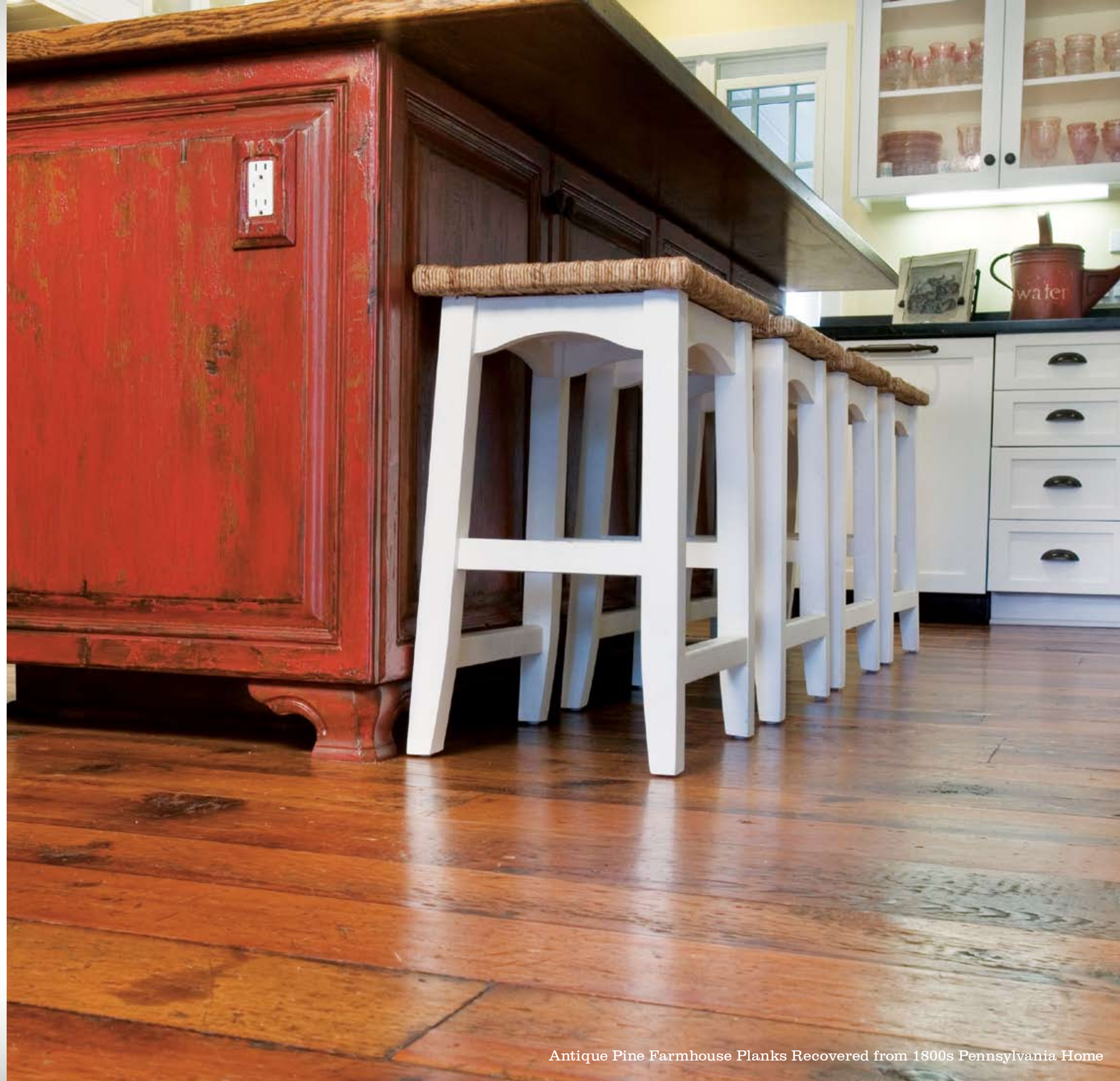
Antique Pine Farmhouse Planks Recovered from 1800s Pennsylvania Home