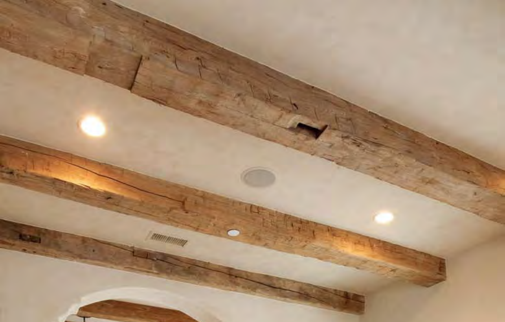
Authentic Hand Hewn Oak Beam from Pennsylvania Barn