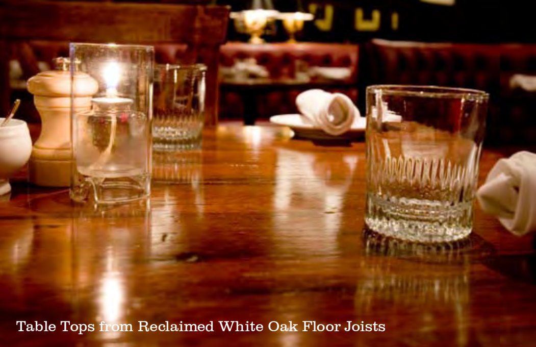
Table Tops from Reclaimed White Oak Floor Joists