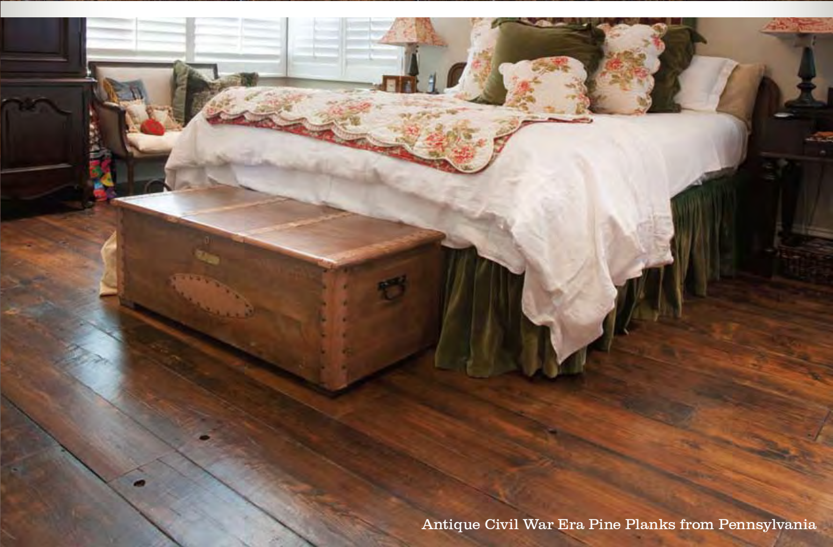
Antique Civil War Era Pine Planks from Pennsylvania