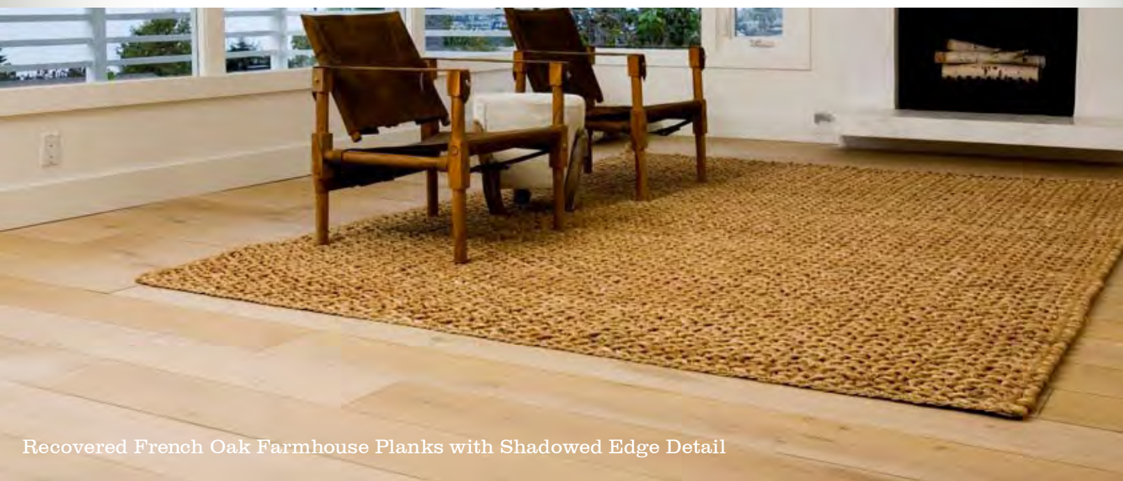
Recovered French Oak Farmhouse Planks with Shadowed Edge Detail

It resonates in each of us, the intrigue of finding a treasure; something special and unique. This collection is made up of such materials. The Rare Finds Collection, which is constantly changing, has included everything from flooring made from railroad trestles that were used to cross the Great Salt Lake, to material reclaimed from Chinese temples over 500 years old, to the floors of Amish schoolhouses, to recovered shipping crates from the South Pacific. With this material you not only get a beautiful addition to your home, but you also get an unusual and captivating story to tell.