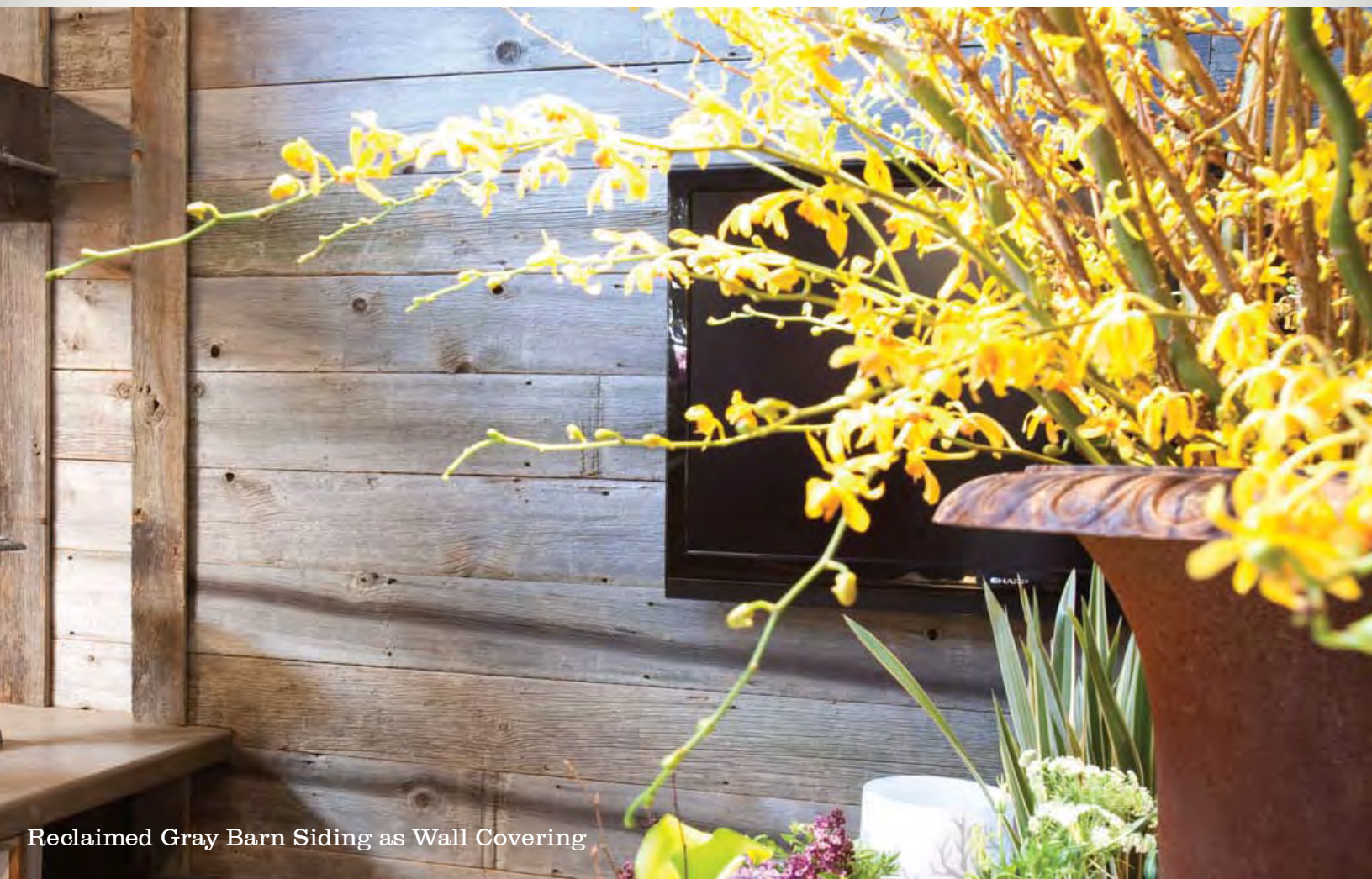
Reclaimed Gray Barn Siding as Wall Covering