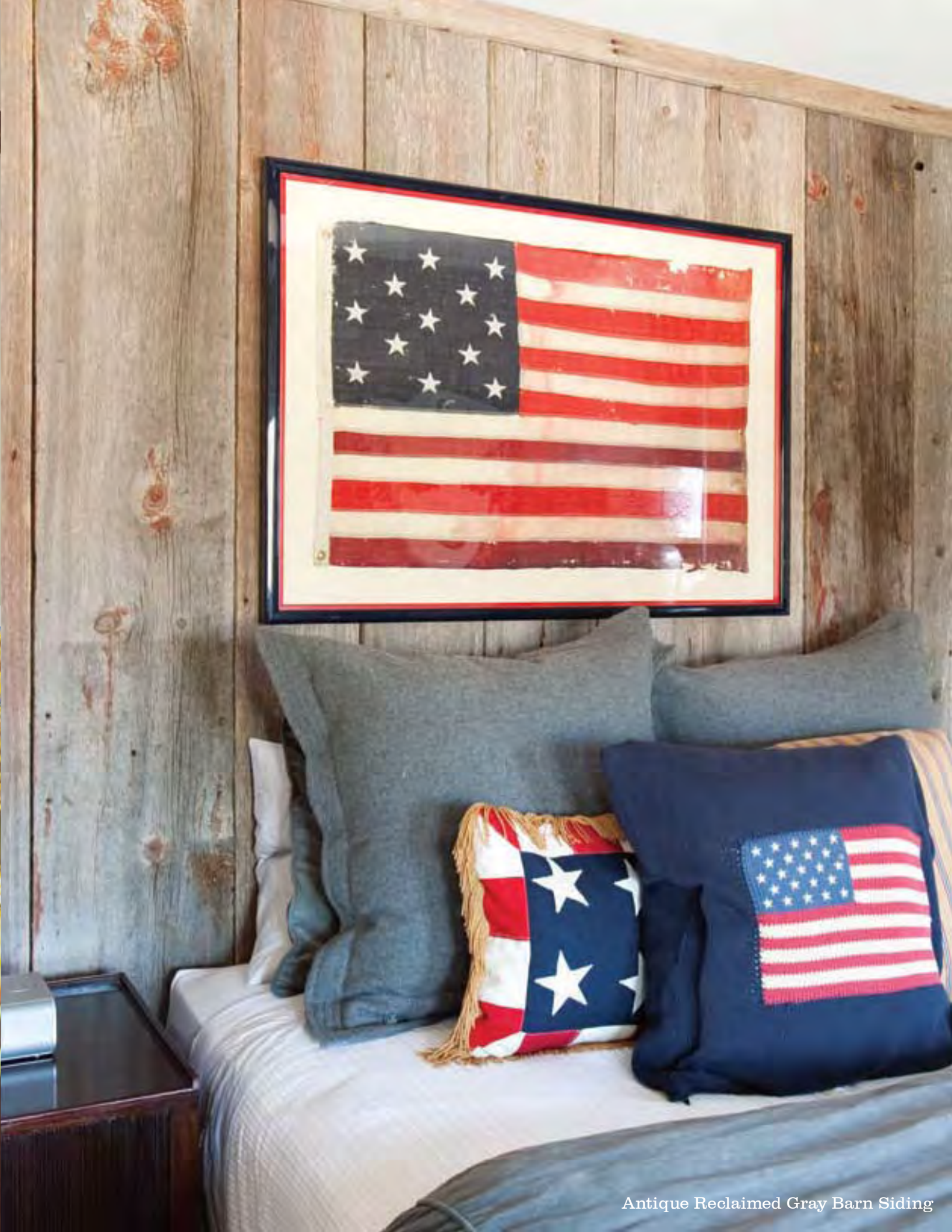
Antique Reclaimed Gray Barn Siding