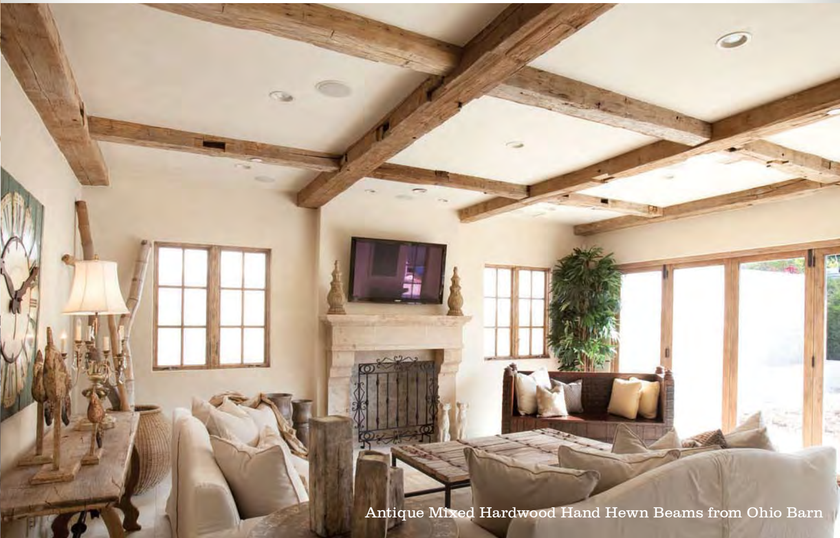
Antique Mixed Hardwood Hand Hewn Beams from Ohio Barn