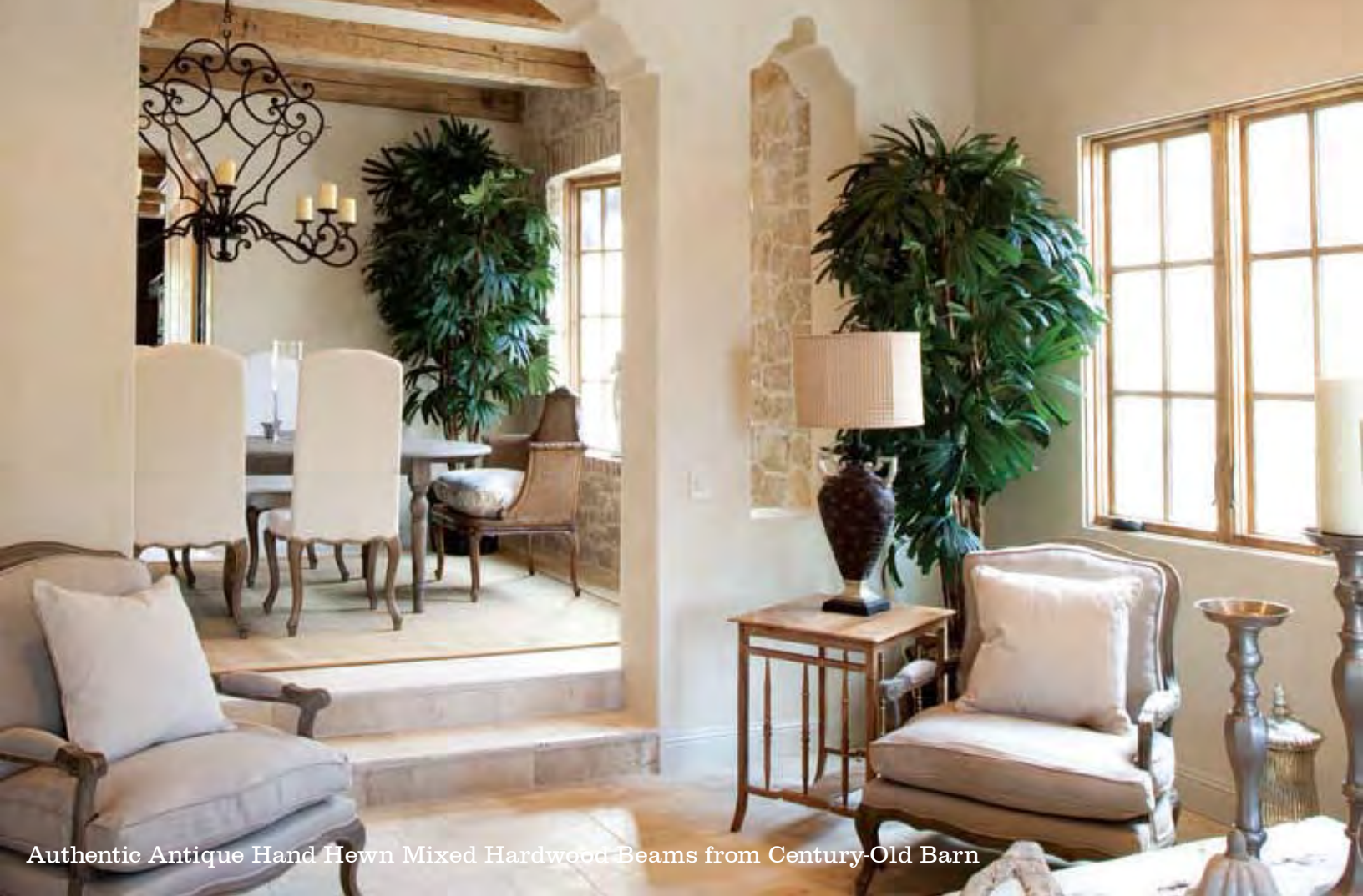
Authentic Antique Hand Hewn Mixed Hardwood Beams from Century-Old Barn