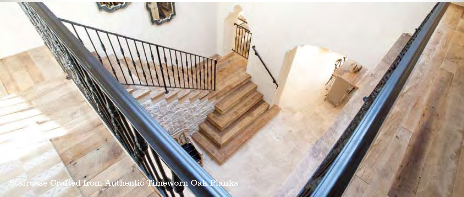
Staircase Crafted from Authentic Timeworn Oak Planks