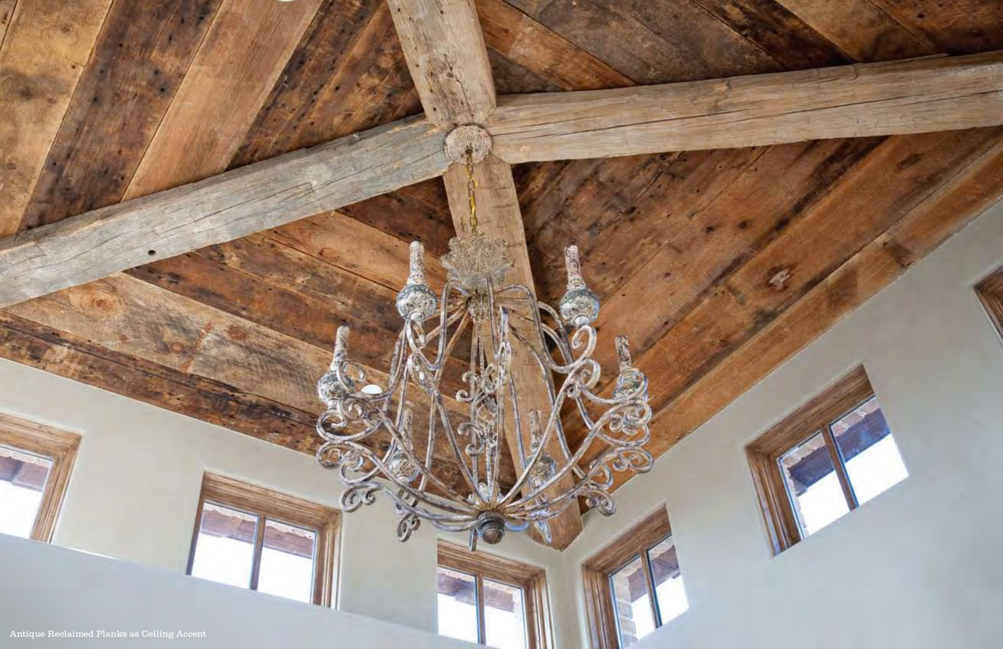
Antique Reclaimed Planks as Ceiling Accent