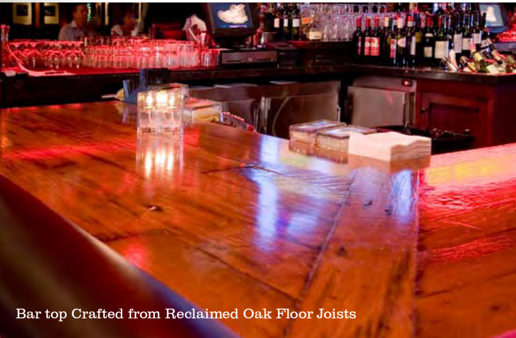
Bar top Crafted from Reclaimed Oak Floor Joists