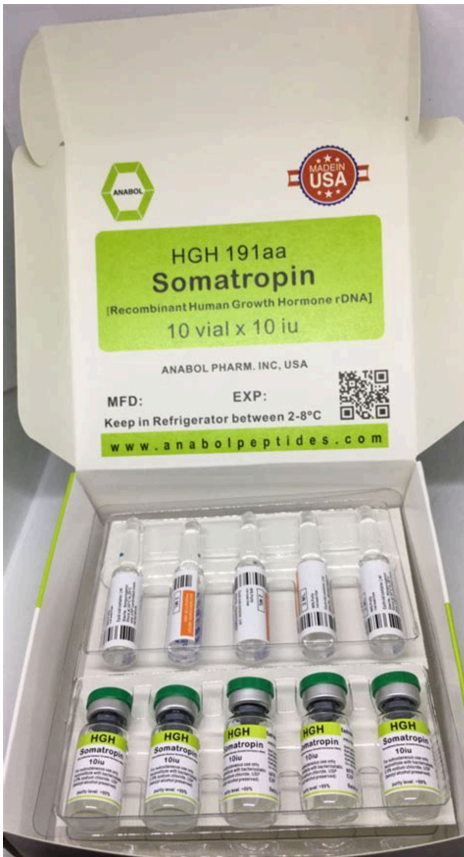
Hexa Price. Buy Tren Hex Online. Be bigger - take perfect supply and put aside your concerns. We will