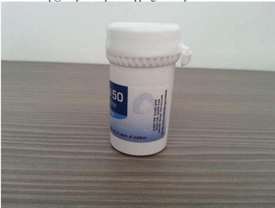
The Hi-Tech Pharmaceuticals

Hi-Tech Pharmaceuticals Jack'd Up 250g is a powerful pre-workout in which it was used in the most powerful components dmaa and agmatine. Log In Register. Account Obserwawane(0) UK +44 (0) 7593 378943. sklep@bodyshock.pro. Shipping Country.