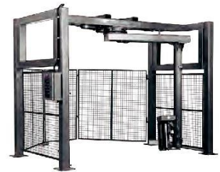
4 leg – free standing