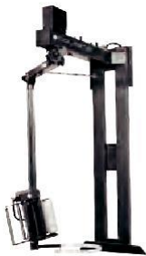
Wall or Post Mount

Choose a frame that fits your production situation.