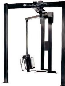
3 leg – Free-Standing