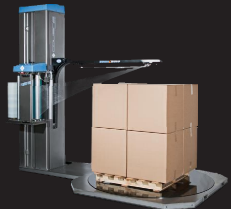
The Switch with A-Arm installed