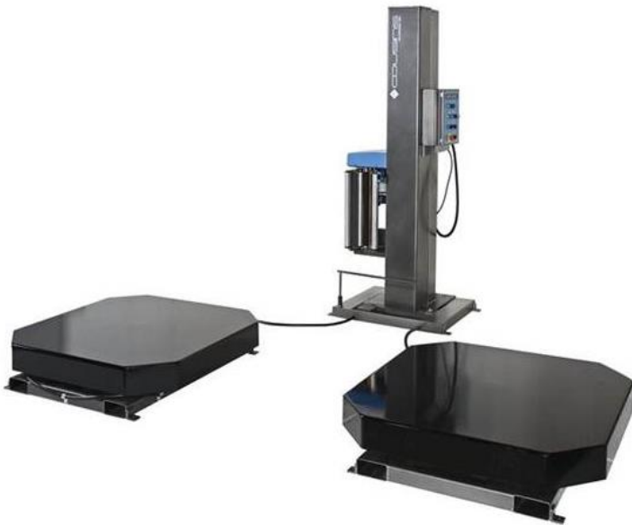
HP (high profile model)

The main advantage of a dual turntable machine is the ability to have one pallet being wrapped while the operator brings another to the second turntable. The operator can continuously alternate loads with the two turntables which will increase productivity. The dual turntable option is available in both low profile (LP) and high profile (HP) models.