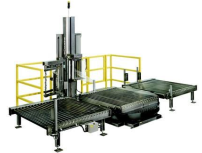
6100-45 / 6100-65