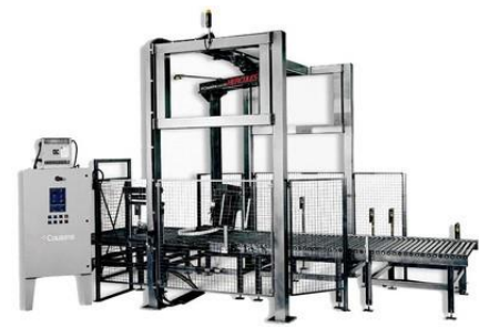
7100-65 / 7100-95