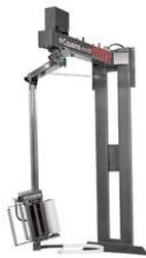
4100T-PM or WM