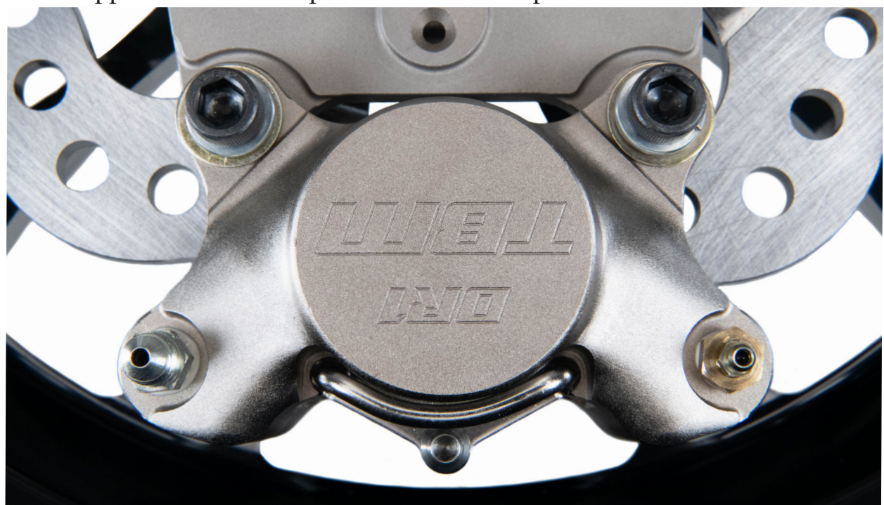
Step 7: Remove the pad retainer bolt. Insert the brake pads from the top of the caliper and reinsert the pad retainer bolt. Hold the pads against the caliper housing. Spin the rotor assembly to check for contact between the rotor / pads. There should be no contact between the rotor / pads. If the pads contact the rotor caliper shimming with supplied shims (.010, .031 .062) may be required. Be sure to tighten the pad retainer bolt.

Step 6 : Slide the caliper as a whole over the rotor and mount it to the bracket. Snug the 3/8-24 bolts, lock washer, and washer. Check for proper radial and horizontal clearance between the rotor and the caliper. Also check for parallelism with the caliper to rotor face, some struts (especially struts with welded caliper mounts) require different shimming between the upper and lower caliper bolts to achieve parallelism.