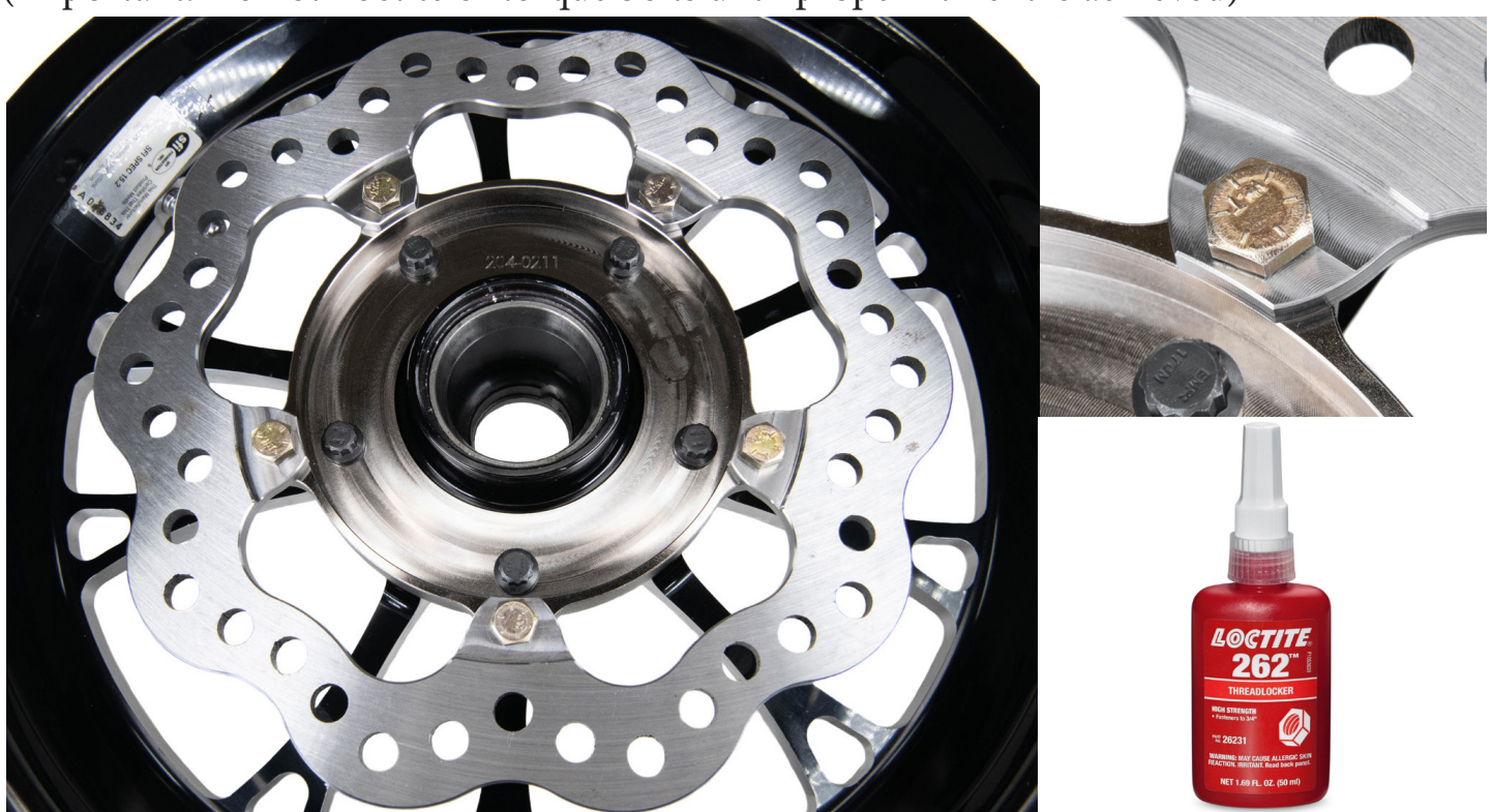
Step 3: Apply Red Loctite to the 5/16-18 X 5/8" Hex Head Bolts, torque to 18 ft-lbs. (Important: Do not Loctite or torque bolts until proper fitment is achieved)