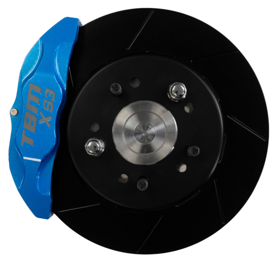
Step 8: Remove the pad retainer pin (if already inserted). Insert the brake pads from the top of the caliper and reinsert the pad retainer pin. Hold the pads against the caliper housing. Spin the rotor assembly to check for contact between the rotor and brake pads. There should be no contact between the rotor and pads. Be sure to reinstalled the pad retainer pin and clip once pads are installed.