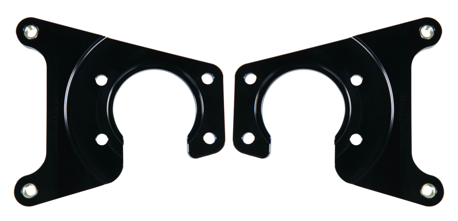
Step 2: Install the caliper bracket around the axle bearing and insure that your axle bearing is seated and retained by the mounting bracket. Secure bracket with existing hard-ware and torque to factory specs. After tightening check to see if there is any play in the bearing/seat, if there is you may need to add shims between the bearing and housing to prevent axle play. (Note: Axle bracket in pictures below may not be accurate to your kit.)