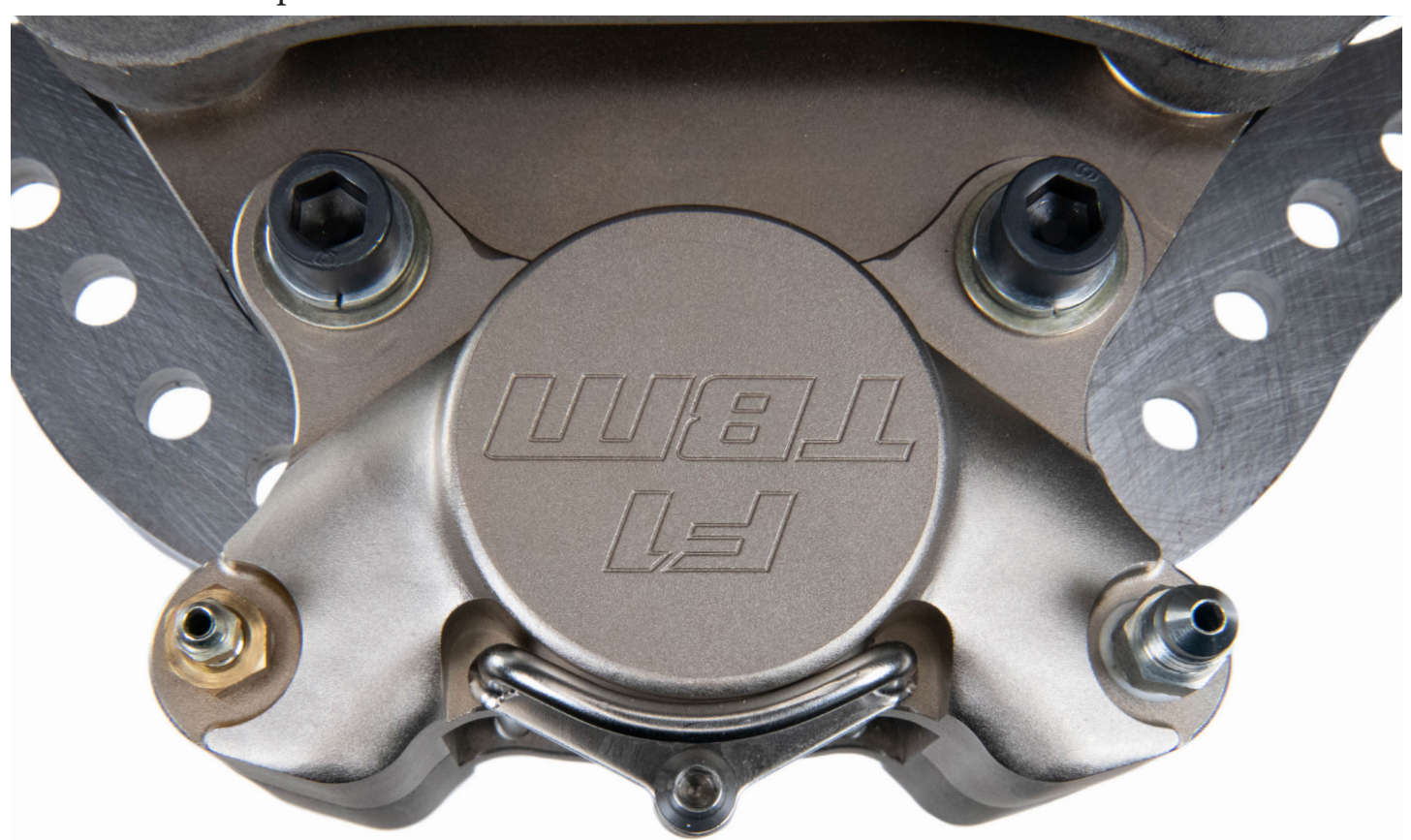
Step 6: Remove the pad retainer bolt (if already inserted). Insert the brake pads from the top of the caliper and reinsert the pad retainer bolt. Hold the pads against the caliper housing. Spin the rotor assembly to check for contact between the rotor and brake pads. There should be no contact between the rotor and pads. Tighten pad retainer bolt.