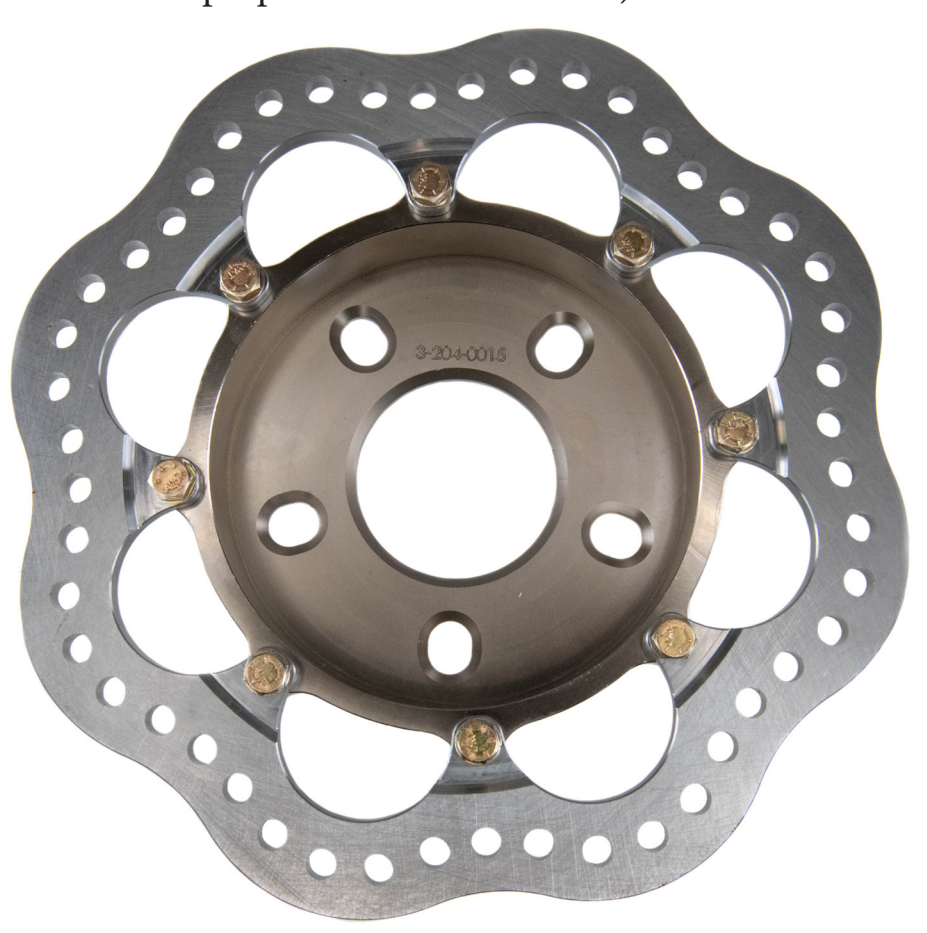
Step 2: Apply Red Loctite to the 5/16-18 hex bolts, torque to 18 ft-lbs. (Important: do not Loctite or torque bolts until proper fitment is achieved)

Step 1: Lay the hat bowl-side up and place the flat side of rotor on the hat. It may be necessary to flip the rotor to achieve proper rotor spacing based on brand and build series of spindle. (Important: for your convenience, we recommend mocking up all fasteners and assembly before torquing and Loctite bolts).