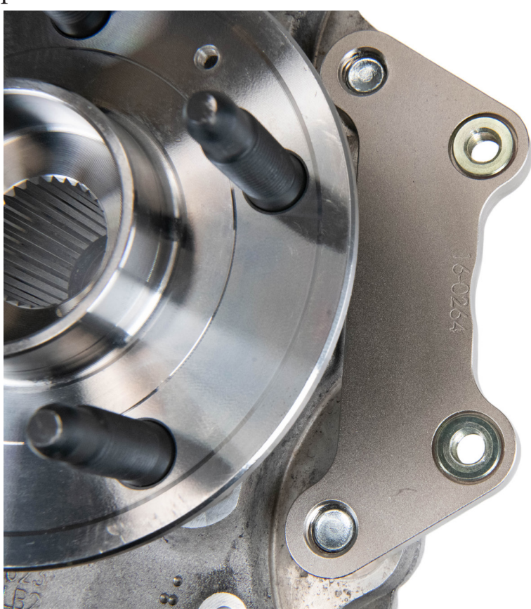
Step 4 : Slide hat and rotor assembly onto the hub and secure with studs.