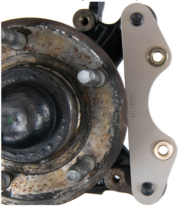
Step 4. Slide hat and rotor assembly onto the hub and secure with studs.