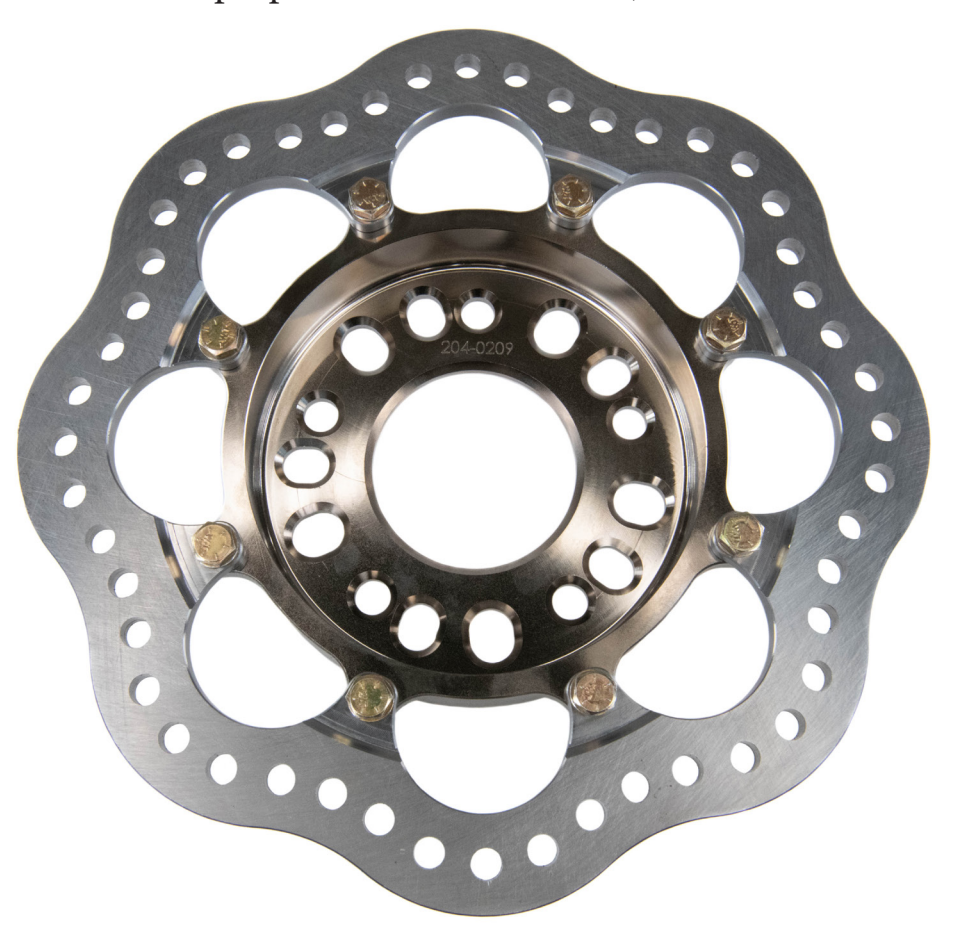
Step 2: Apply Red Loctite to the 5/16-18 hex bolts, torque to 18 ft-lbs. (Important: do not Loctite or torque bolts until proper fitment is achieved)

Step 1: Lay the hat bowl-side up and place the flat side of rotor on the hat. It may be necessary to flip the rotor to achieve proper rotor spacing based on brand and build series of spindle. (Important: for your convenience, we recommend mocking up all fasteners and assembly before torquing and Loctite bolts).