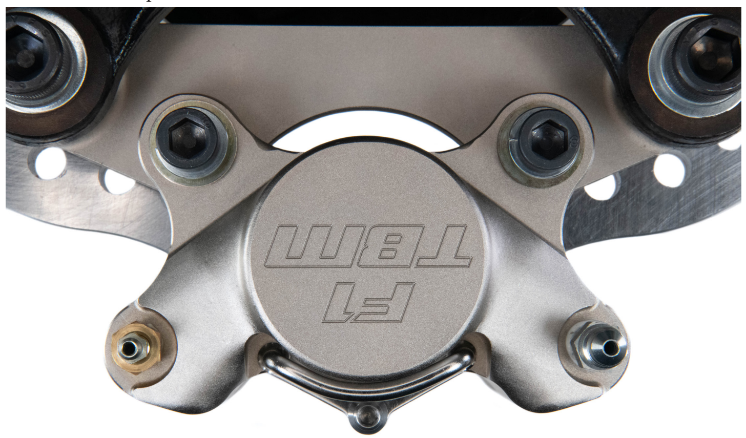
Step 6: Remove the pad retainer bolt (if already inserted). Insert the brake pads from the top of the caliper and reinsert the pad retainer bolt. Hold the pads against the caliper housing. Spin the rotor assembly to check for contact between the rotor and brake pads. There should be no contact between the rotor and pads. Tighten pad retainer bolt.