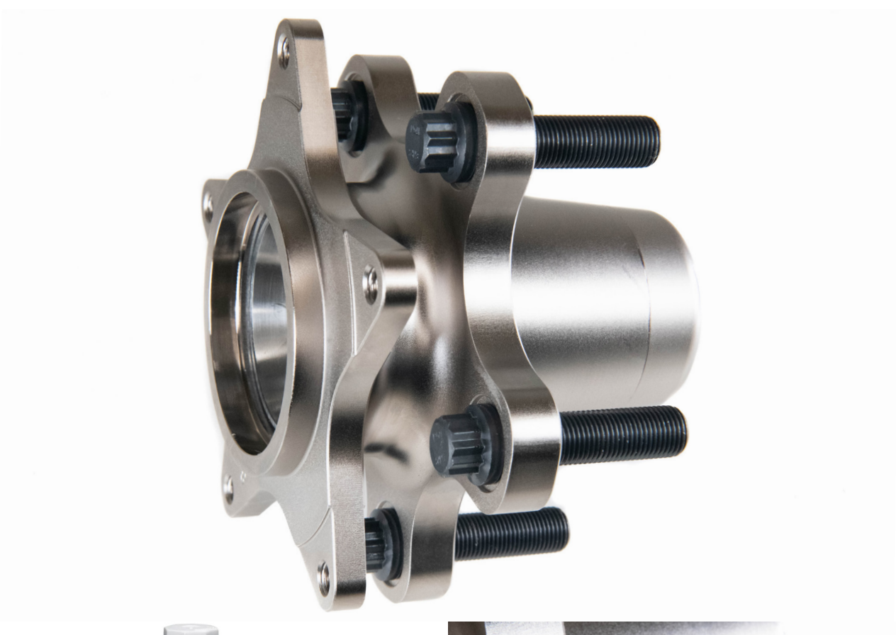
Step 2: Apply Red Loctite to the 1/2" -20 wheel studs and fasten them to the hub. Torque to 60 ft-lbs.

Step 1: Remove the existing brake components and ensure the spindle is clean and free of debris.