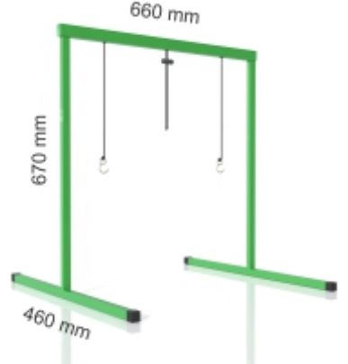
LIGHT STANDS AVAILABLE