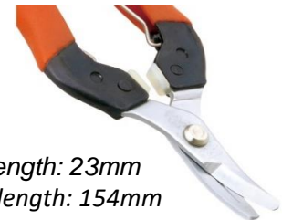
AG-2 Blade length: 23mm Overall length: 154mm