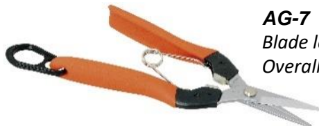
AG-7 Blade length: 35mm Overall length: 177mm

For picking fruit, flowers, gathering vegetables, and gardening