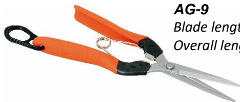
AG-9 Blade length: 58mm Overall length: 200mm