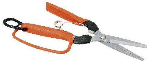
AG-10G: Attach a handle protection Blade length: 63mm Overall length: 210mm