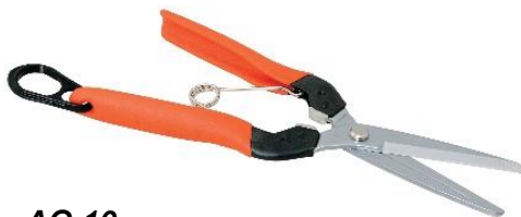
AG-10 Blade length: 63mm Overall length: 210mm