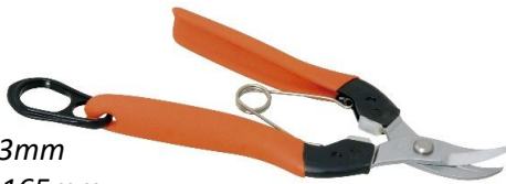
AG-1 Blade length: 23mm Overall length: 165mm