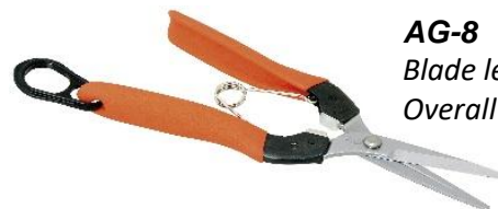
AG-8 Blade length: 48mm Overall length: 190mm