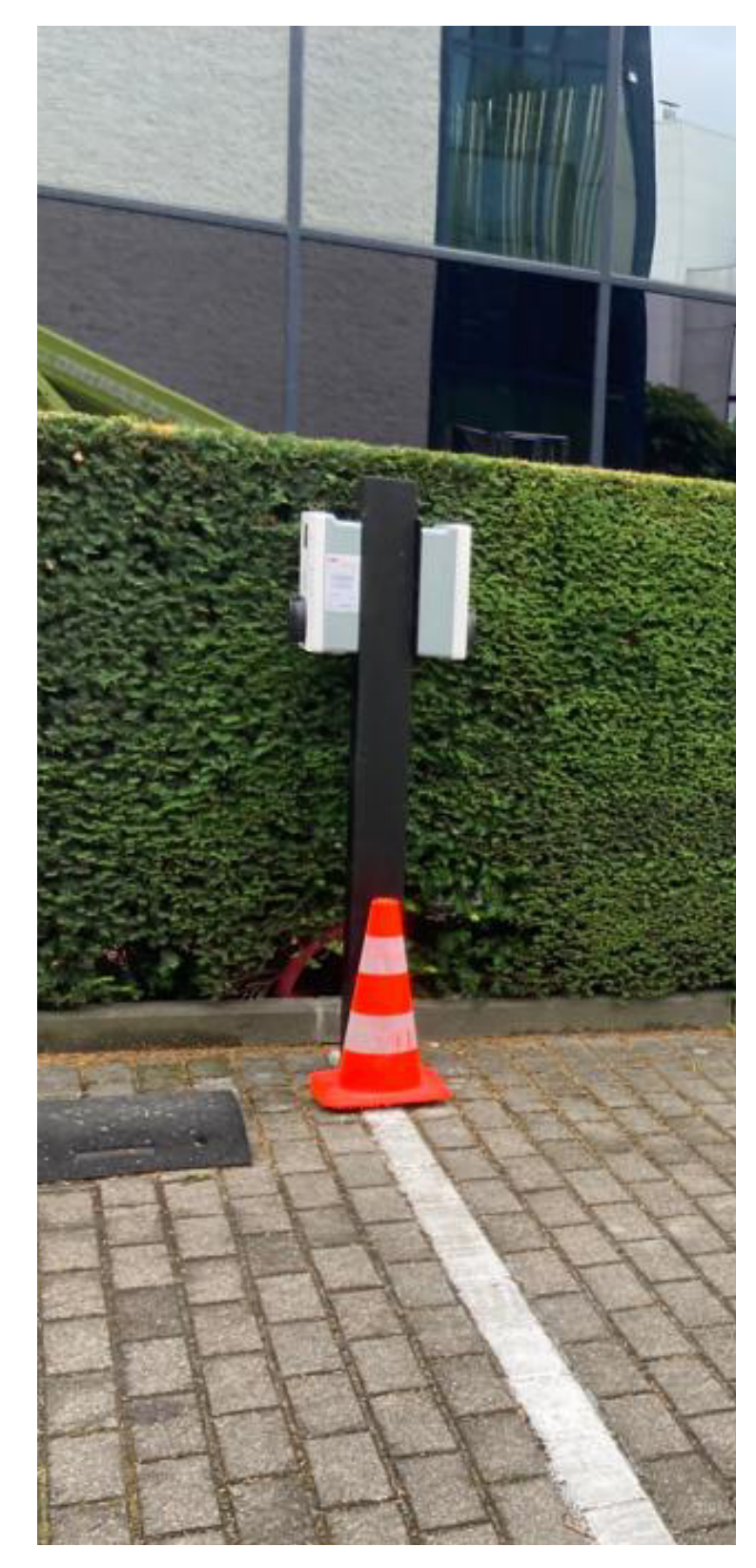
Adaptor plates for various charging stations (two included)