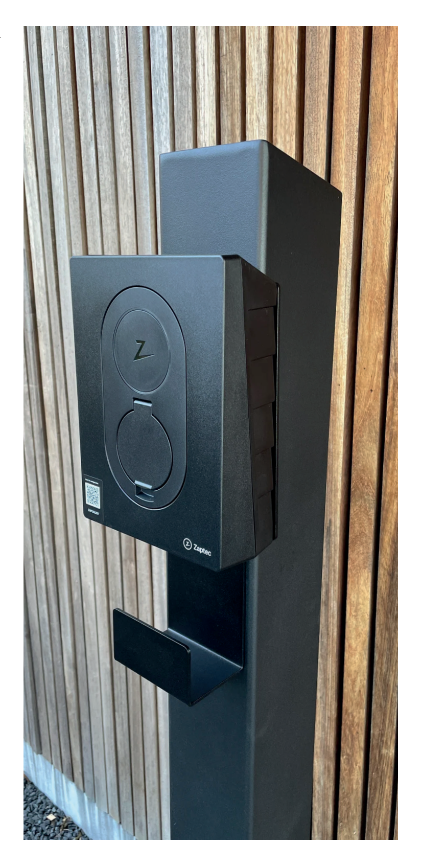
Adaptor plates for various charging stations (one included)