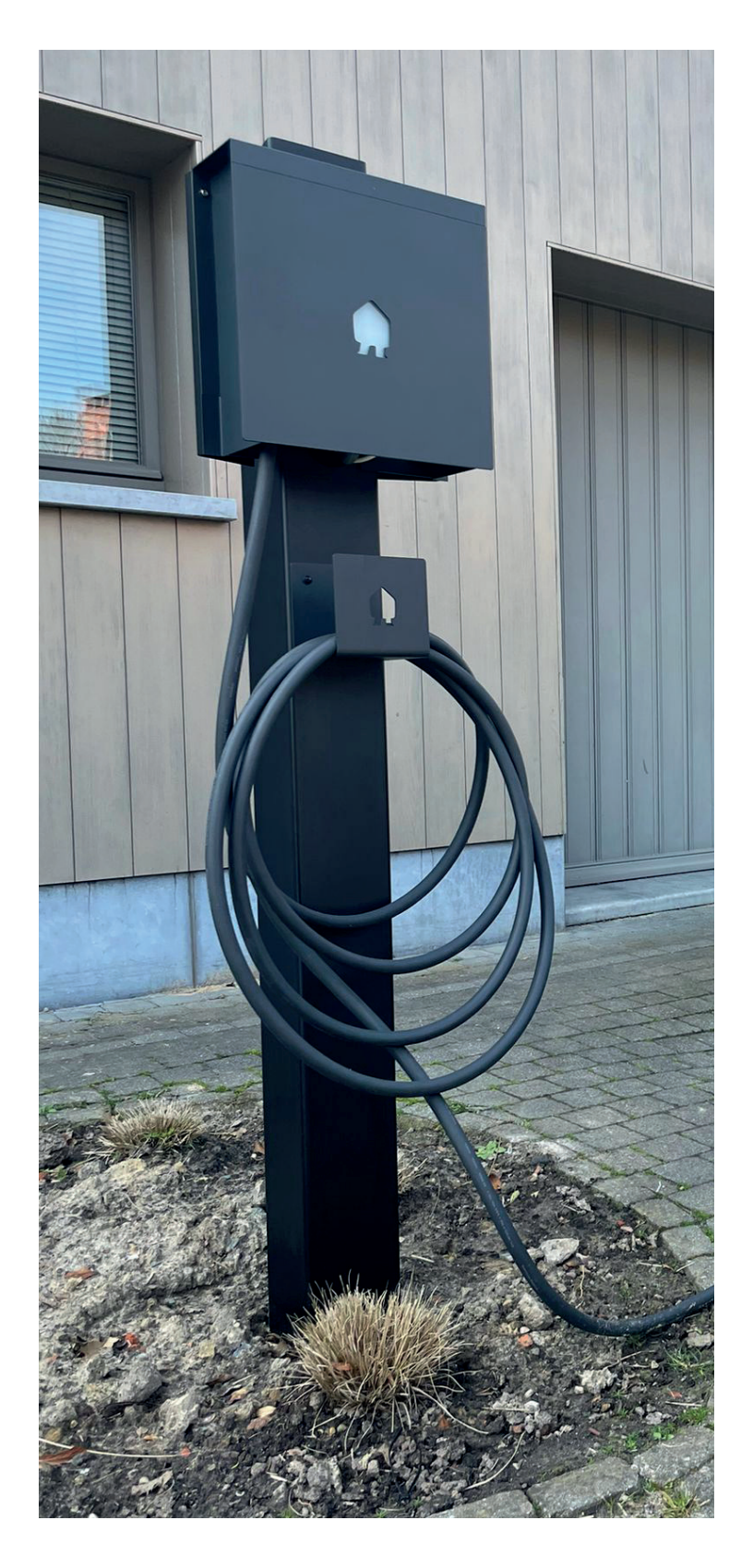
Adaptor plates for various charging stations (one included)