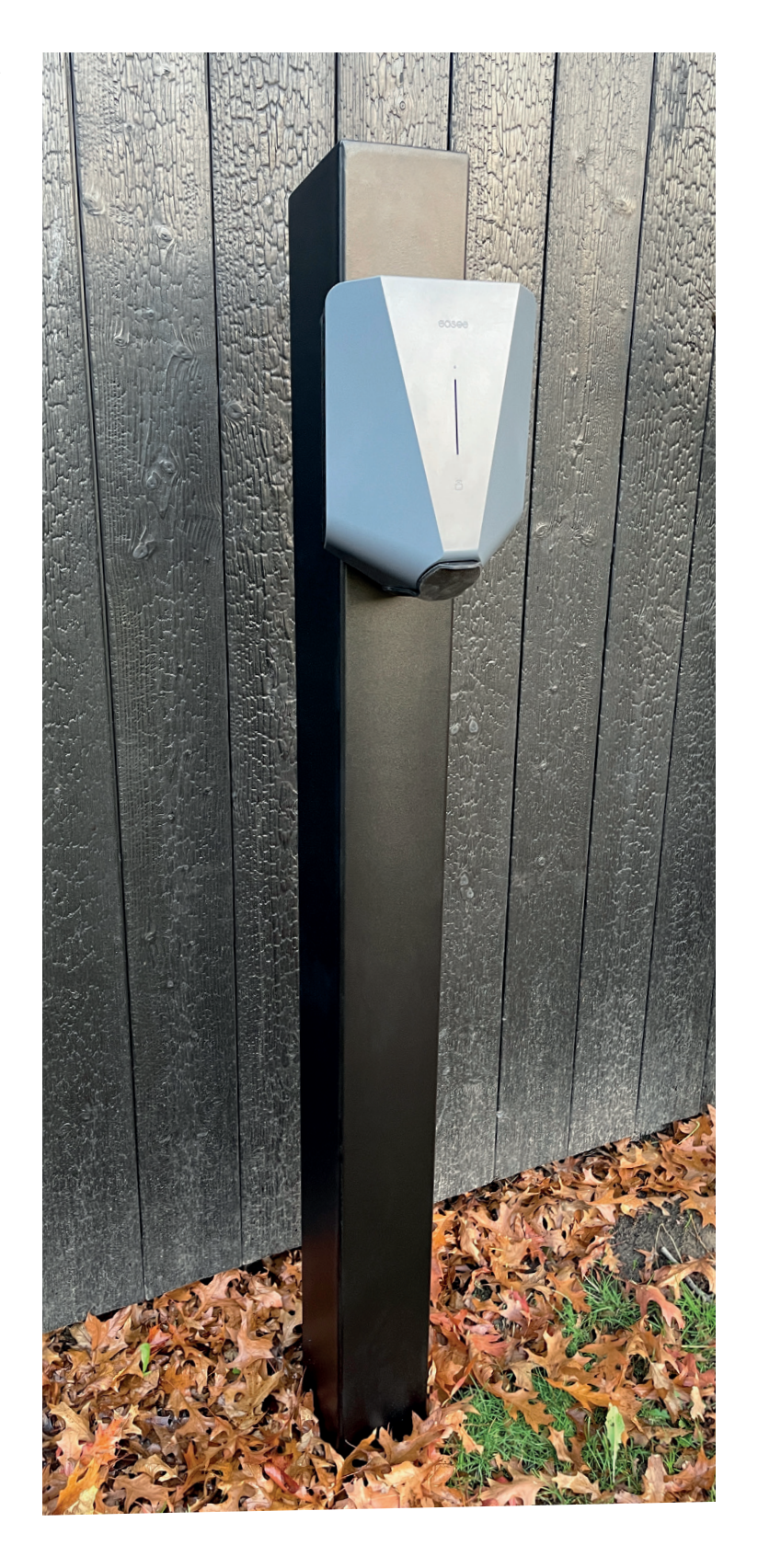
Adaptor plates for various charging stations (one included)