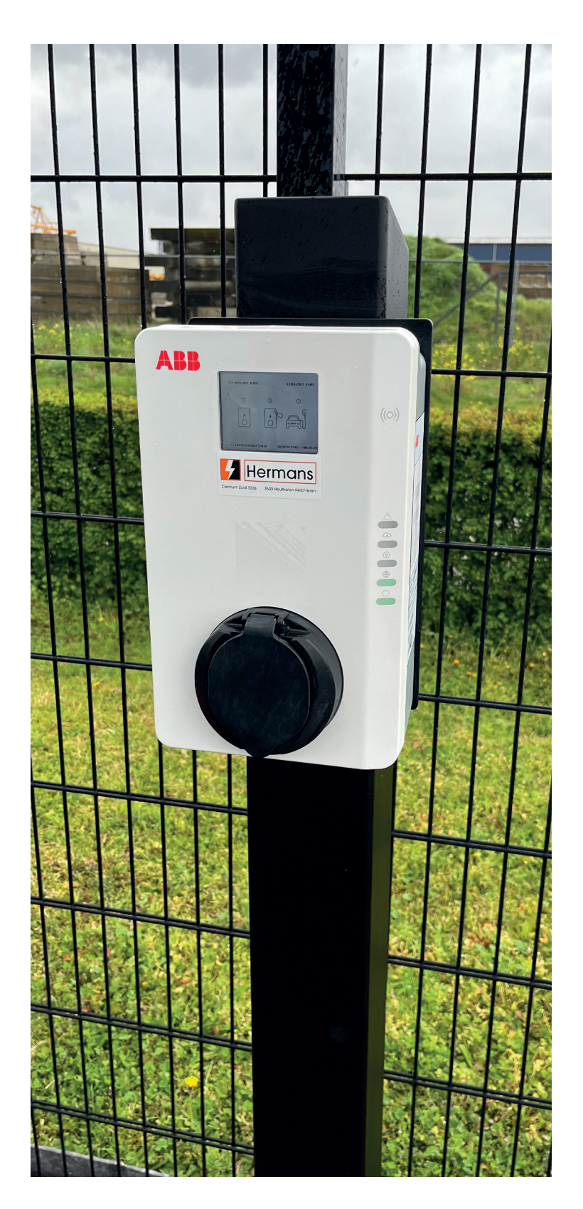
Adaptor plates for various charging stations (one included)