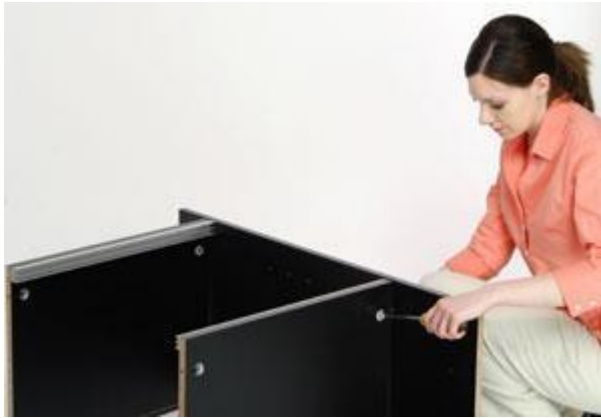
Step 6: Tighten cam locks clockwise.