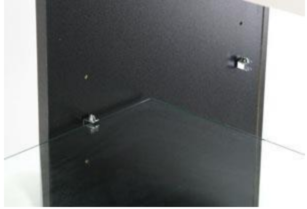
Step 11: Flip unit right side up. Insert shelf pegs at desired heights. (You may need a rubber mallet – the pegs are a tight fit).