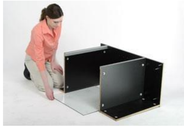
Step 7: Carefully slide glass panel into grooves.