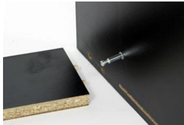
Step 3: Use wooden pegs to connect top front panel to side panel.