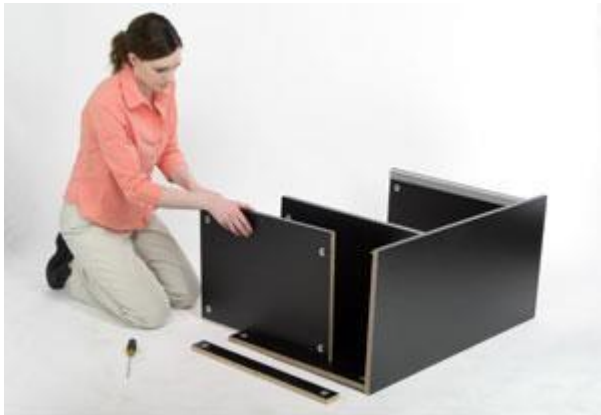
Step 8: Attach bottom shelf panel.