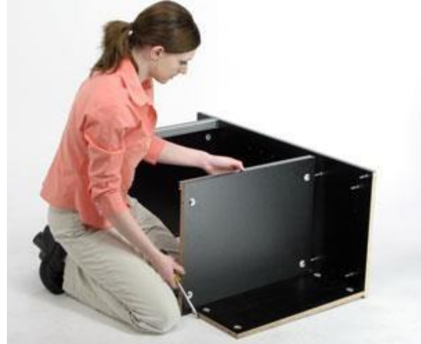
Step 5: Insert second panel with aluminum channels making sure that the channels are facing inward towards the other panel with channels.