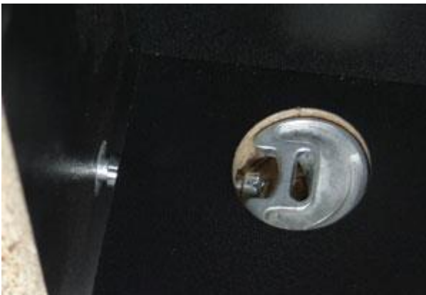
Proper alignment of cam lock. Using a flathead screwdriver, turn clockwise to tighten