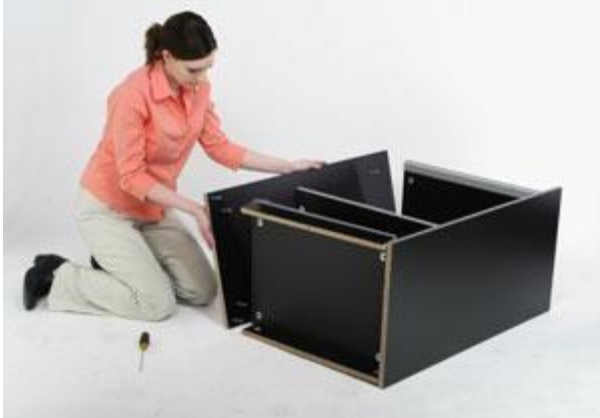
Step 10: Attach side panel and tighten remaining cam locks.