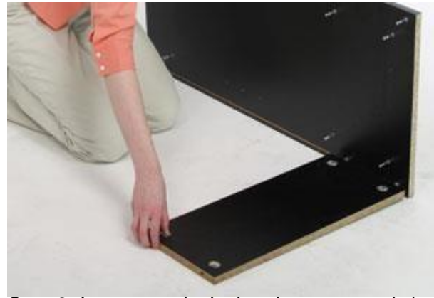
Step 2: Insert cam locks into bottom panel. (see image below) Connect bottom panel to side panel by tightening cam locks.