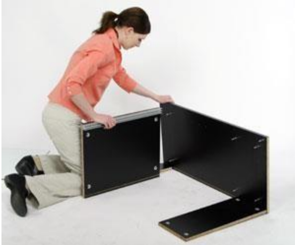
Step 4: Insert first panel with aluminum channels and tighten cam locks.