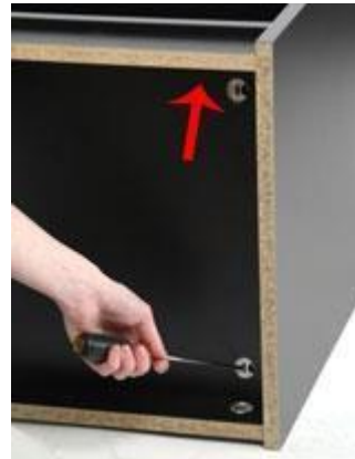
Step 9: Attach bottom support and tighten cam locks.