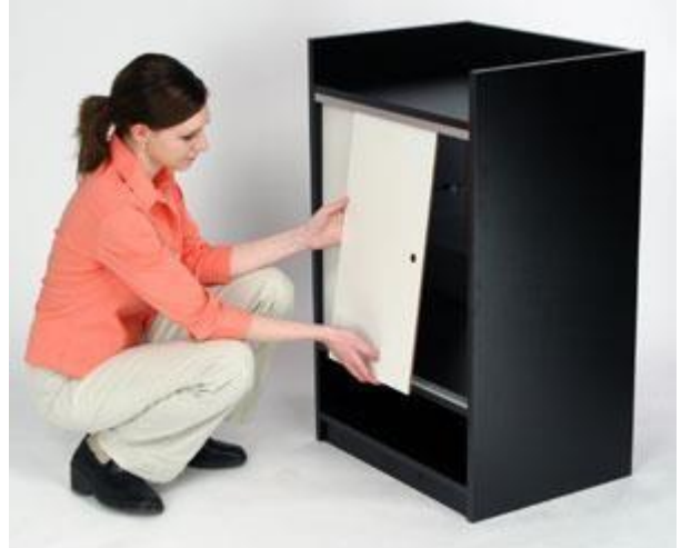
Step 13: Insert the top of the door panel into the top inner channel. Drop door into bottom inner channel. Repeat for other door, using the outer channel.

You are now ready to use your cash wrap!