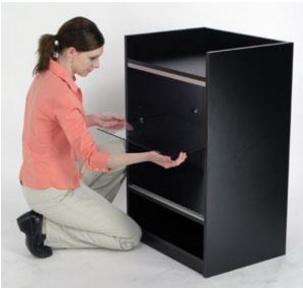
Step 12: Slide in the glass shelf and use a screwdriver to tighten the shelf pegs so that the glass is secured firmly in place.